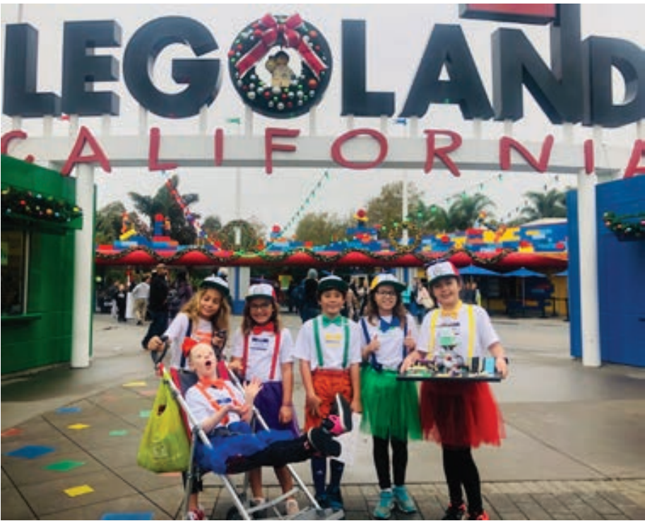
In second grade, all students study an exciting twelve-week coding and robotics curriculum with the support of LEGOLAND® California Resort.

presentations by local professionals. • At Carlsbad High School, our Internship Academy places over 100 student interns in local businesses each year. At Sage Creek High School, students tap the rich resources in the community for expertise as they create their Genius Projects. • Nordson Corporation continues to support the Tech Time STEM essay challenge for all middle schoolers, robotics at middle and high school, and the SEMI Hi Tech