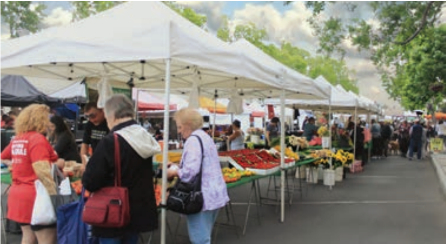
The weekly certified organic State Street Farmers' Market - which happens every Wednesday, celebrated its 25th anniversary last year.