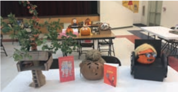
5th graders at Calavera Hills Elementary designed pumpkin book characters.

At the elementary school level, all sites have, or are in the process of developing, STEAM (Science, Technology, Engineering, Arts, &