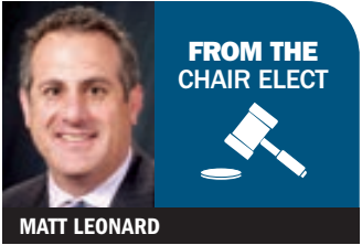
Chairman Elect CARLSBAD CHAMBER OF COMMERCE