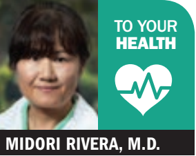
Family Medicine SCRIPPS COASTAL MEDICAL CENTER

Curved or “clubbed” nails happen when the fingertips enlarge and the growing nails curve around them. This is a gradual process that often develops over several years and may be inherited, or may be associated with lung disease, inflammatory bowel disease, cardiovascular