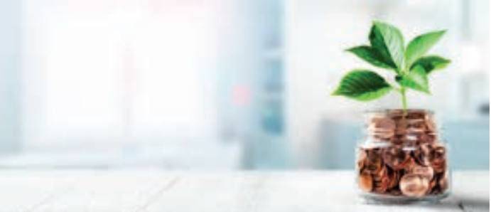
Maintaining an emergency savings can help you during times of need.

only impactful in Carlsbad, but also impacts the greater county of San Diego. This month's Carlsbad Business Journal focuses on financial preparedness. As a financial advisor, I would like to share a few basic tips on financial preparedness.