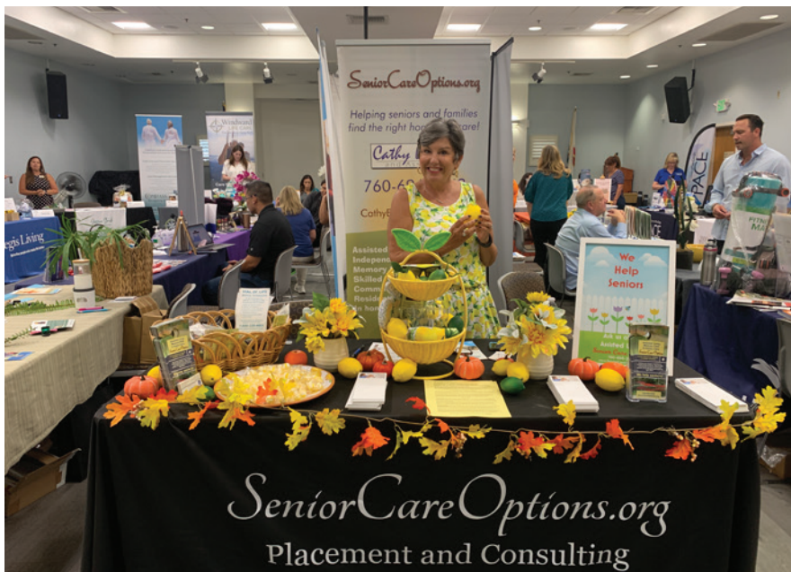
Join a variety of senior care booths at our Older & Bolder Expo on Saturday, September 14, 2024 from 9 - 1pm at the Carlsbad Senior Center and learn how to age better.

The Older & Bolder EXPO is free to attend and does not require registration. For businesses interested in a booth space or sponsorship, go to https://web.carlsbad.org/events/Older%20Bolder%20EXPO-3833/ details for more information.