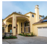
Pacifica House Inpatient Care