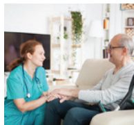
Patient Care In-Home