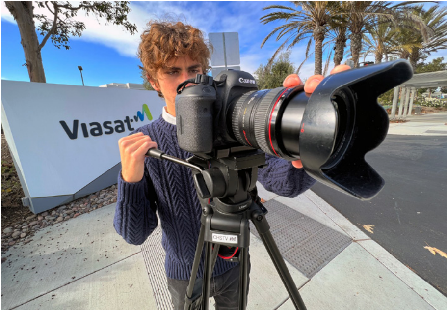
Carlsbad’s emerging scientists have participated in the Science Olympiad, supported by Viasat, Inc.

First and foremost is our invaluable partnership with the Carlsbad Educational Foundation (CEF), and its partners, in the many career programs it facilitates for Carlsbad Unified students. In these CEF-supported programs, elementary students are learning to build and code through the Lego Robotics curriculum for all second graders, culminating in a learning trip to LEGOLAND California Resort ; observing wildlife on Agua Hedionda Lagoon field trips for all third graders; studying vegetables and sustainable practices on Coastal