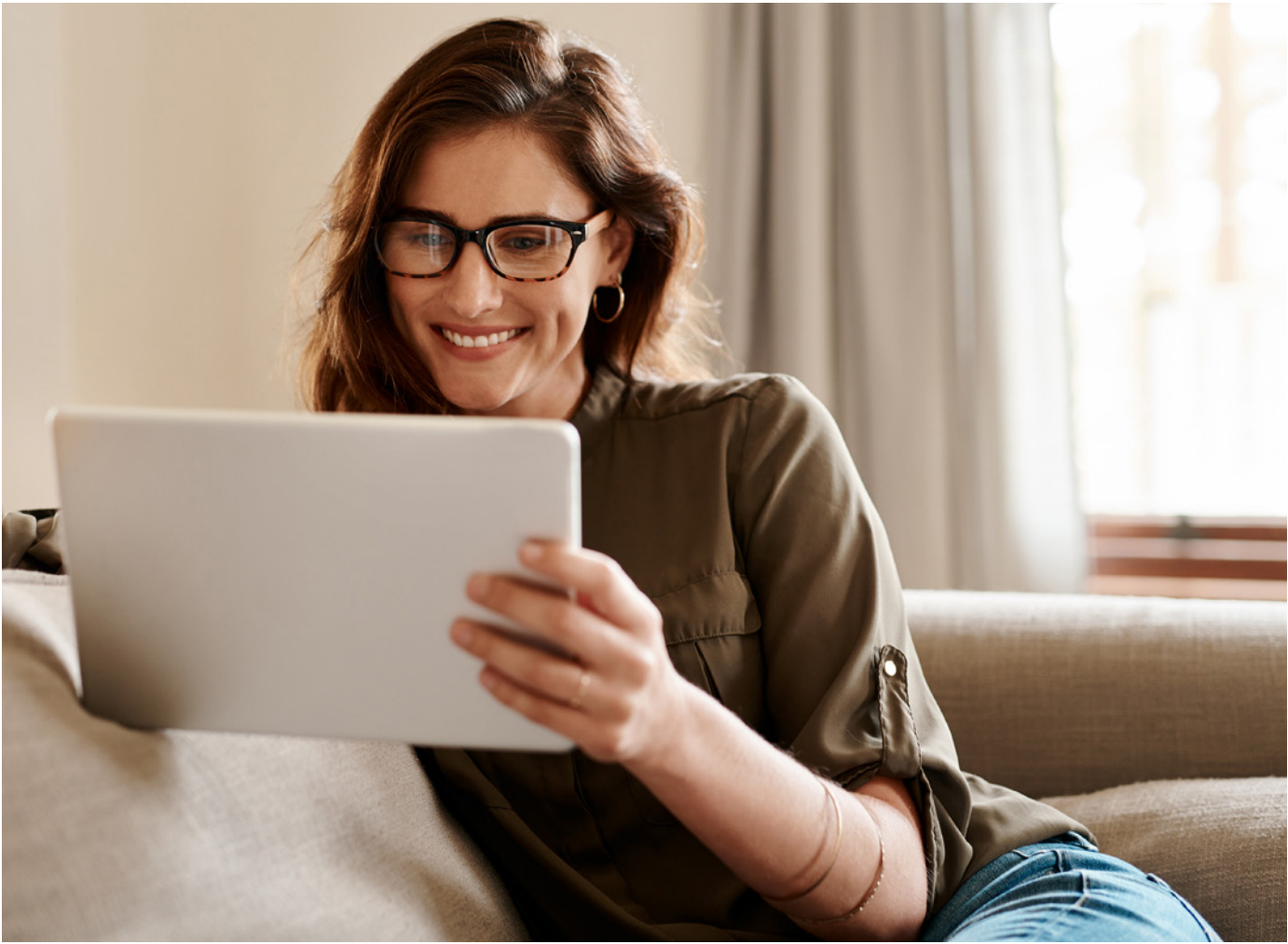
Virtual appointments help patients to continue to receive the best care — helping them manage certain conditions or symptoms they might be experiencing—without leaving home.

Many Scripps HealthExpress walk-in, same-day clinics are open with weekend