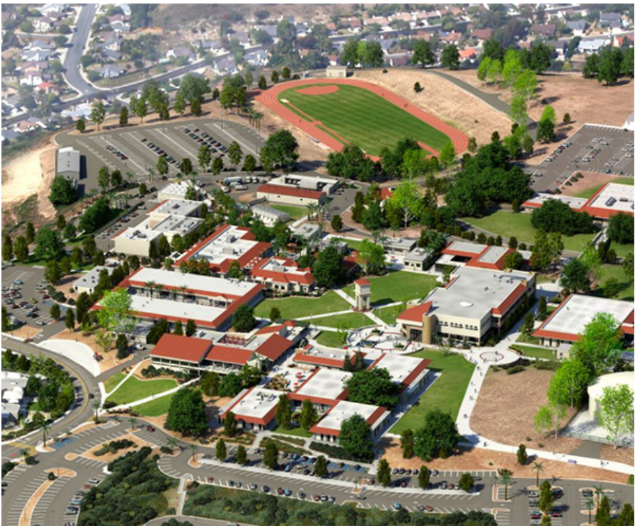
MiraCosta College has been named in Top 150 Community Colleges, and will compete for $1 million Aspen Prize.

“In an era of persistent inequity and workforce talent gaps, our nation’s best community colleges are stepping up to deliver