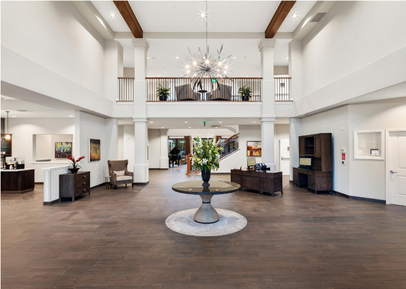
Exquisite senior living begins at Santianna, a new Oakmont Signature Living community in Carlsbad opening in early 2022.

Customized care services ensure that Santianna meets the individual needs of each resident. Assistance with personal care, medication management and physical therapy are just some of the services available as needed. A concierge medicine program allows access to same day and