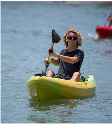
Located on Carlsbad’s iconic Aqua Hedionda Lagoon, California Watersports offers locals and visitors a great opportunity to explore the lagoon on a kayak, paddleboard, boat, and more.