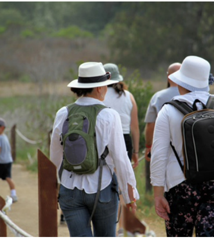
The Batiquitos Lagoon North Shore trail runs 1.6 miles along the lagoon. Once hikers get to the end, they turn around and walk back. That makes for a 3.2 mile walk without hills and is the perfect length and difficulty level for leisurely exercise.

Carlsbad features a wide range of trails for hikers of all levels. The trail at Batiquitos Lagoon is a favorite one. “People always say that Batiquitos is like an oasis within an urban environment,” says Batiquitos Lagoon Foundation Vice President, Deb Mossa. “When you make the first turn and get away from the freeway it becomes very quiet and peaceful. After a while it can feel like you are in the middle of nowhere. It is tranquil and the trail is easy to navigate; flat and wide.” The Foundation is in charge of protecting this precious Carlsbad wetland so that it can continue to provide wellness benefits to future generations. “Many studies have shown that exposure to nature is part of general well being for humans. Being out in the sunshine, smelling the sage and other native plants, hearing the birds sing and seeing them flying over the lagoon or wading on the shore is nourishment for the soul. Many people who live here in Carlsbad, like myself,