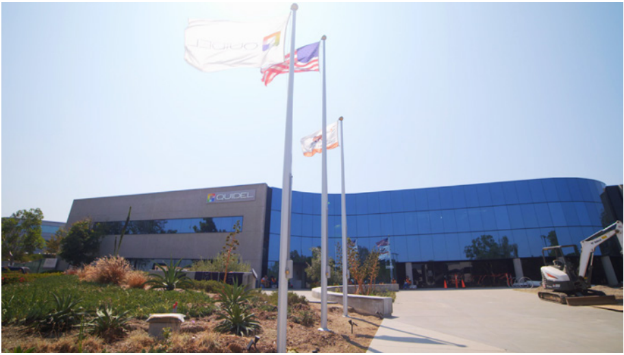
For FDA Emergency Use Authorization (EUA) only*

We went on to introduce our Sofia “ABC” test*, the first combination test for Influenza A, Influenza B and COVID-19. Our QuickVue rapid antigen test soon followed and