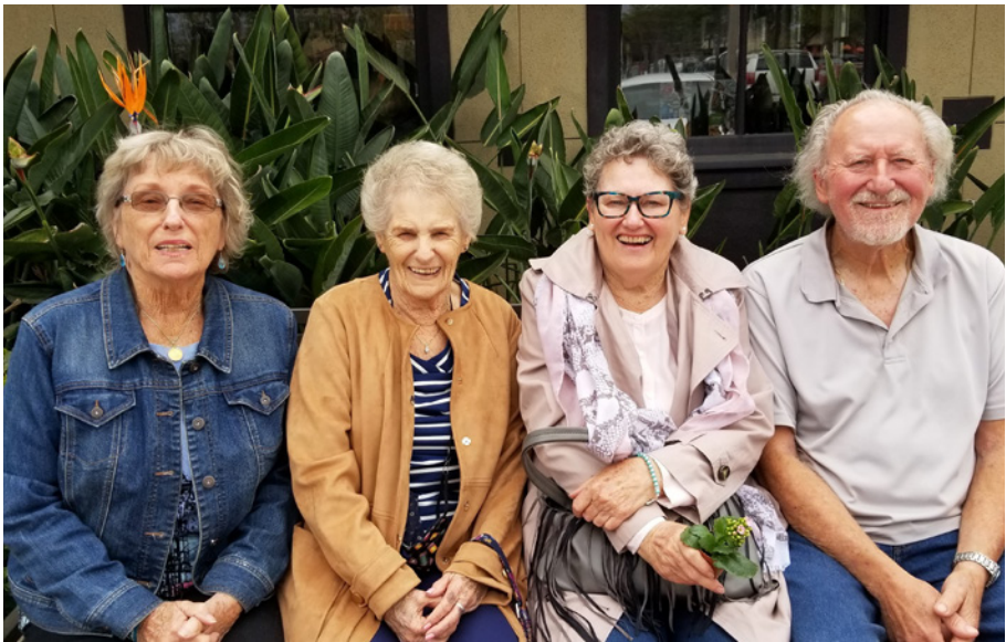
Whether seniors are looking for a large community with meals, activities, transportation and care or a small board and care home, Senior Care Options can help them find the right place.