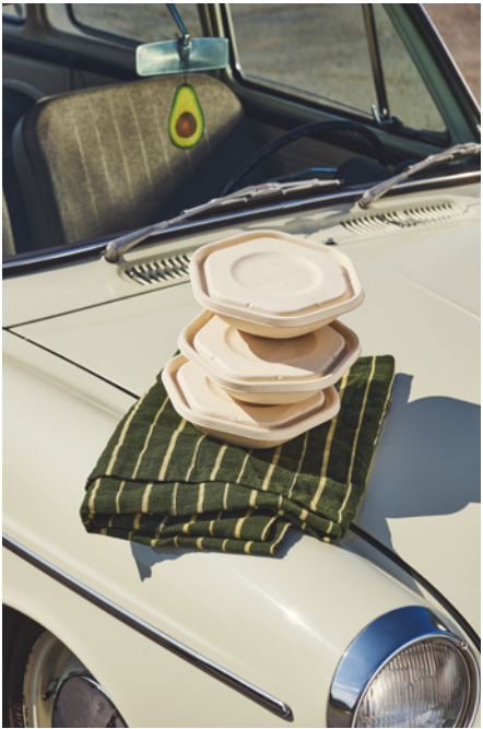
sweetgreen®’s menu features unprocessed ingredients, including 30+ plants that stay whole until our team starts chopping.

past 15 years, we’ve built a network of 200 food partners across the country. Our supply chain is organized into regional distribution networks that align retail proximity with cultivation to allow for more transparency from seed to bowl. Our plant-forward, earth-friendly menu