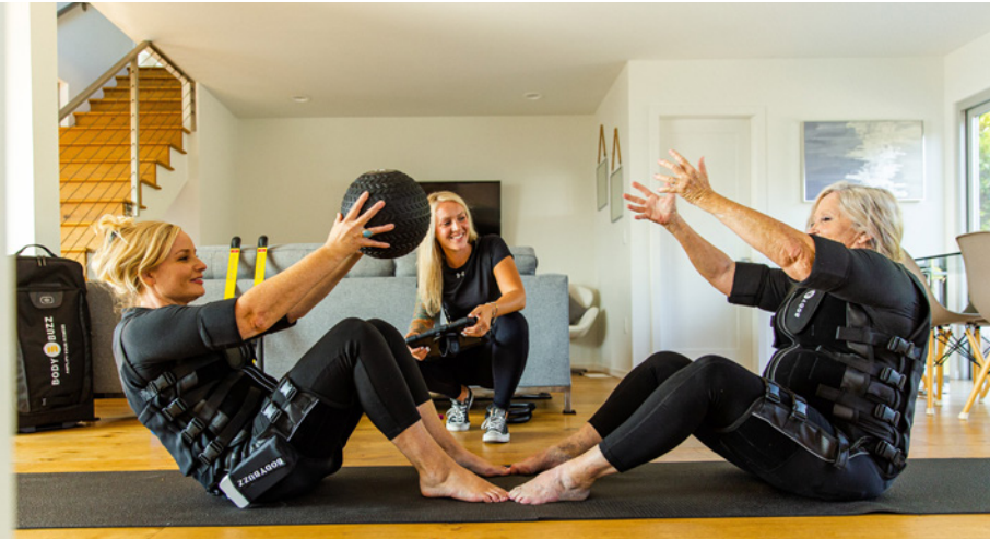
Clients train at home with a Bodybuzz certified trainer.