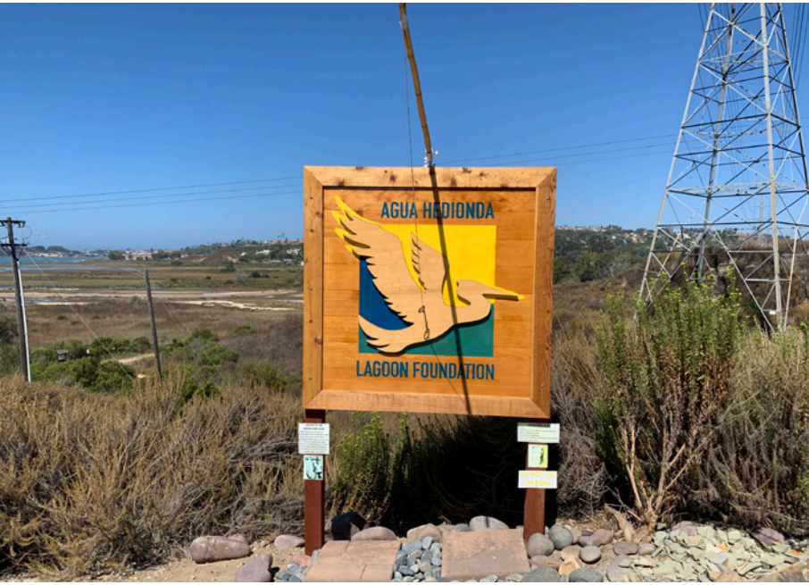
The Agua Hedionda Lagoon Foundation's mission is "to inspire people through education and outreach to preserve the Agua Hedionda Lagoon as an accessible and healthy watershed."

well-deserved CBAD Award. The Carlsbad Chamber is honored to support such a dedicated group. Congratulations! If you haven't had the opportunity to check it out, I encourage you to see what this