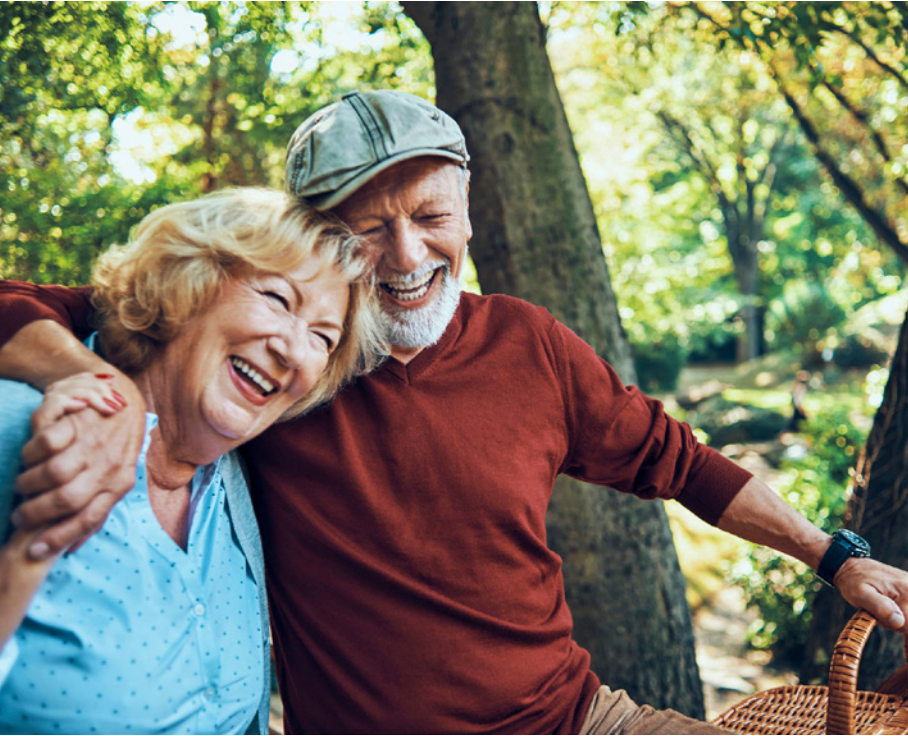
Westmont Living offers support for couples with varying health needs.