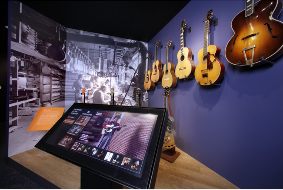
The renovation of the Museum of Making Music consisted of an update of the interpretive technology, a reorganization of the storyline, the reconfiguration of the physical space, and an increase in interactive engagement opportunities.

Having originally opened to the public in 2000, we could see that by 2020 the MoMM was going to be ready for a refresh. So, before we were even aware of the looming pandemic, the team launched—and completed—a successful fundraising campaign to fully renovate the museum galleries. The project, which consisted of an update of the interpretive technology, a reorganization of the storyline, the reconfiguration of the physical space, and an increase in interactive engagement opportunities, was completed during the months of pandemic closure enabling us to reopen on June 15, 2021. While