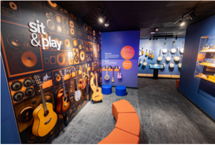
The Museum of Making music remains steadfast in its commitment to encourage people to find their own unique place in this musical world and to advance active participation in music making across the lifespan.

for visitors, the exhibition will provide a view of an industry connecting to its audiences with the right tools at the right time.