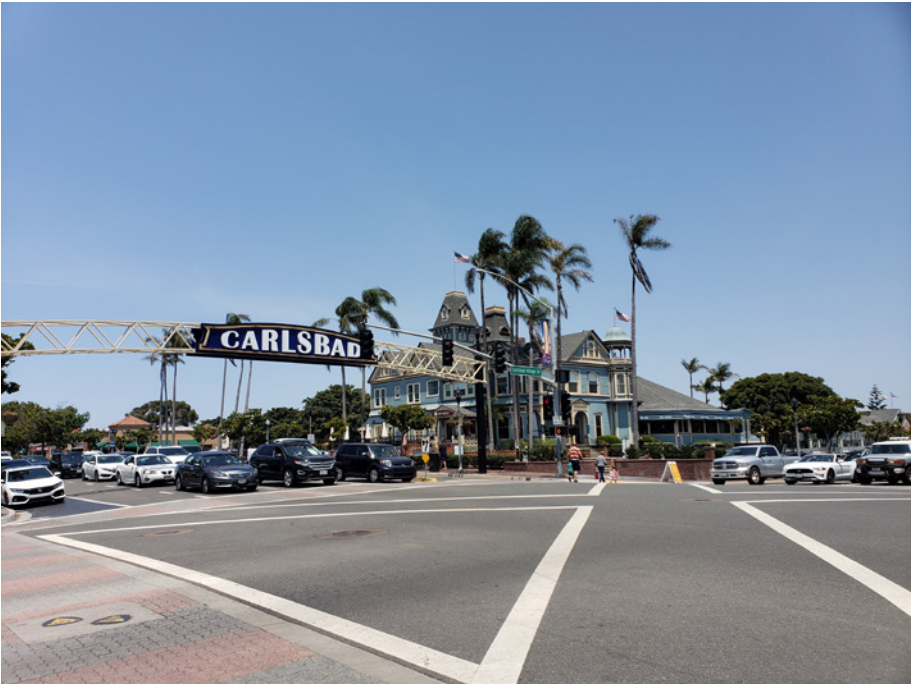
The City of Carlsbad offers programs designed to help small businesses.

Shoppers also earn "bonus bucks" when they buy gift cards. A $40 gift card earns $10; a $75 card earns $25; and a $100 gift card earns $40. These incentives translate into more funds to support participating businesses. In fact, last year's program brought nearly $90,000 of economic activity to our community. Bonus amounts are sponsors