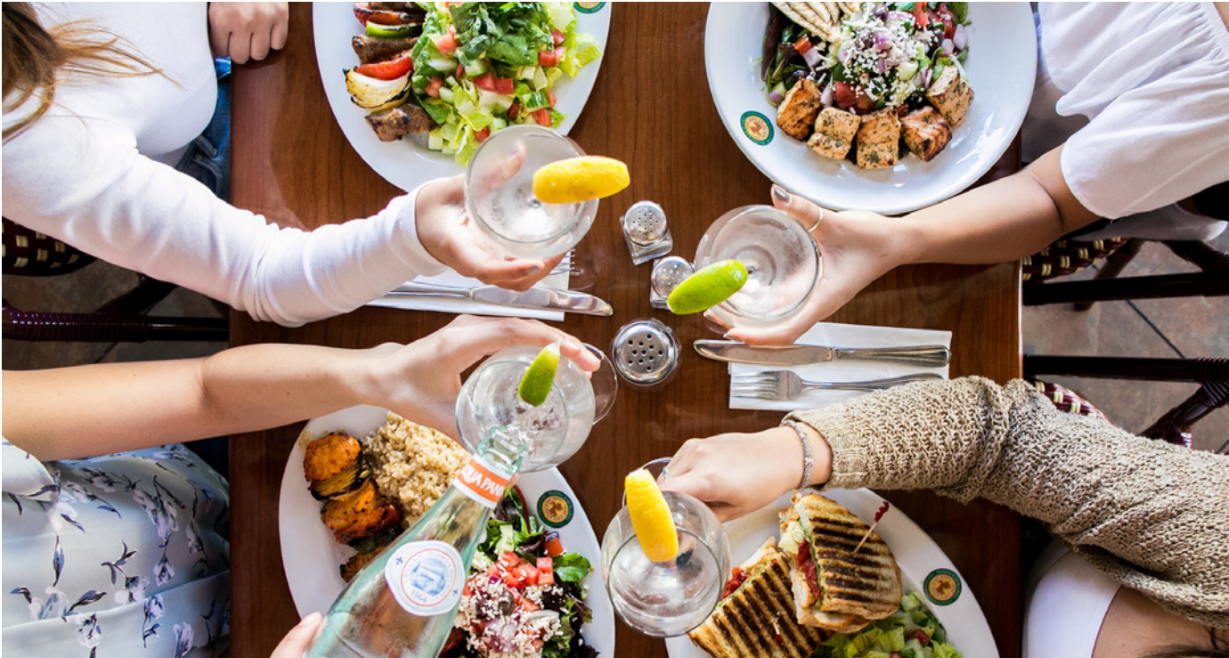
PKG delivers exceptional Mediterranean cuisine due to its daily commitment to preparing food in-house from scratch daily with fresh, exceptional quality ingredients.

When you are craving the authentic flavors of the Mediterranean, travel no further than to PKG. PKG is open for dine-in while protecting guests’ and staff’s safety and following all necessary pandemic guidelines per the local health department. From the ambient lighting and light wood paneling in the cozy dining room to the natural granite tables adorned with tealight candles on the patio, the restaurant’s design naturally provides a warm atmosphere. Fan-favorite dishes to indulge in are the kabob entrees which feature a choice of protein (grilled over an open flame) such as ABF chicken, all-natural beef koobideh, flat iron steak, grass-fed lamb, organic tofu, and mushroom; including two sides of rice and/or salad. Just in time for the holiday, PKG started serving delicious, made-from-scratch pasta entrees which are: Linguine Bolognese, Chicken Pesto Linguine, and Jumbo Shrimp Linguine. These start at a competitive price of below $20.00 per dish. PKG recommends topping off your dinner with scratch-made tiramisu; a top-selling PKG dessert for over a decade.