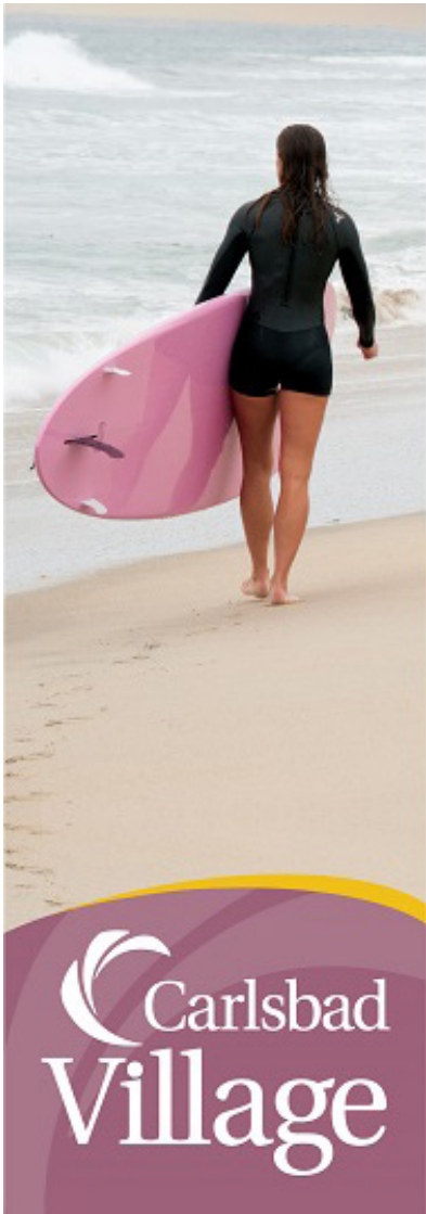
Starting this year, the Carlsbad Village Association (CVA) is managing the banner program for the City of Carlsbad, and its first round of brand-new banners were installed in January.

CVA is already working on a spring theme with the idea that changing out a percentage of the banners at each season will help keep the look and feel fresh. As a Main Street America Affiliate, CVA is proud to be joining the ranks of other main street organizations who