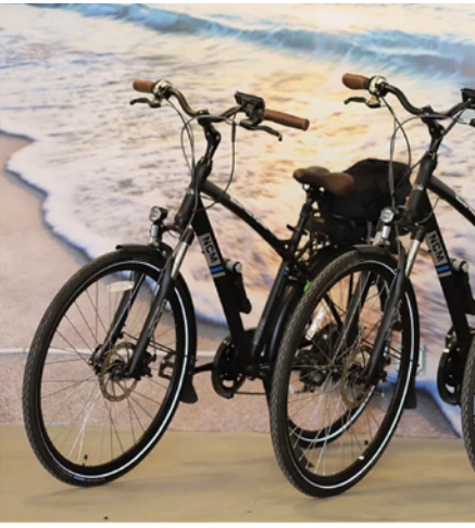
Renting an e-bike or a golf cart, allows those who want to explore Carlsbad, cover more ground in less time.

Located on Carlsbad’s iconic Aqua Hedionda Lagoon, California Watersports offers locals and visitors a great opportunity to explore the lagoon on a kayak, paddleboard,