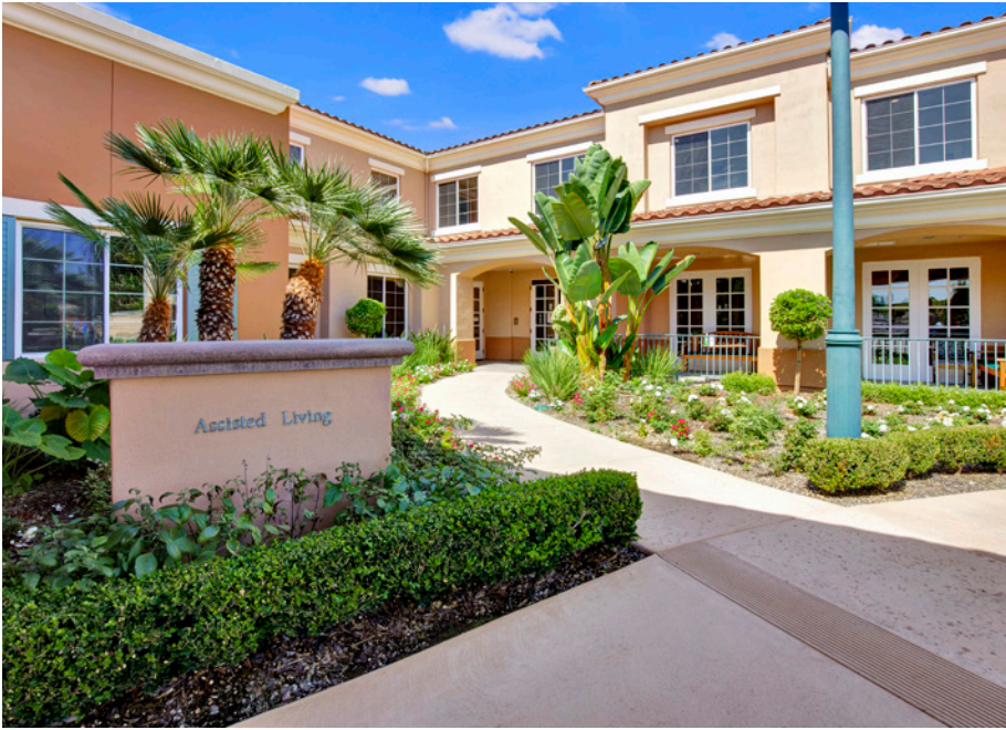
Located in Carlsbad, California, GlenBrook Health Center is a well-respected senior care provider nestled among the rolling hills and provides beautifully landscaped grounds to enjoy.