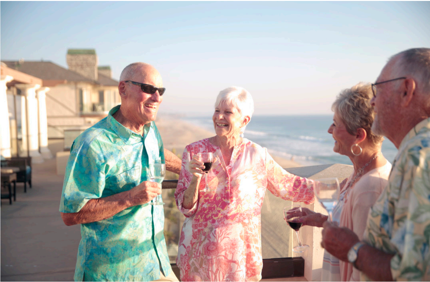
Carlsbad By The Sea Retirement Community offers resort-like services in one of Southern California's most beautiful settings.

Carlsbad By The Sea is an intimate community with fewer than 160 residences, including six premier oceanfront apartments built right into the bluff. Choose from more than 20 floor plans, with styles ranging from studios to penthouses. Patios or balconies