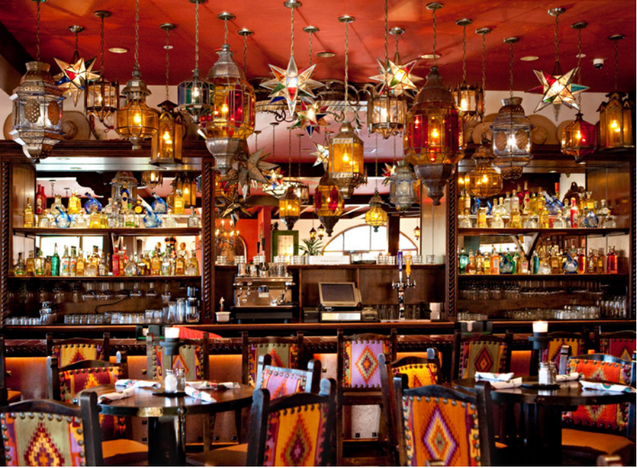
Casa De Bandini is great for formal occasions with open-beam ceiling and Saltillo tile floor with comfortable seating.

This unique Chamber Happy Hour will take place on August 17, from 4:30p.m. to 7:00p.m. and will highlight the City of Carlsbad’s Cultural Arts initiative to integrate the arts into our business environments. This event will be free to all the wonderful people that make Carlsbad a destination within which you can work, stay, and play. I invite you to join us for this new special event. I hope to see you there!