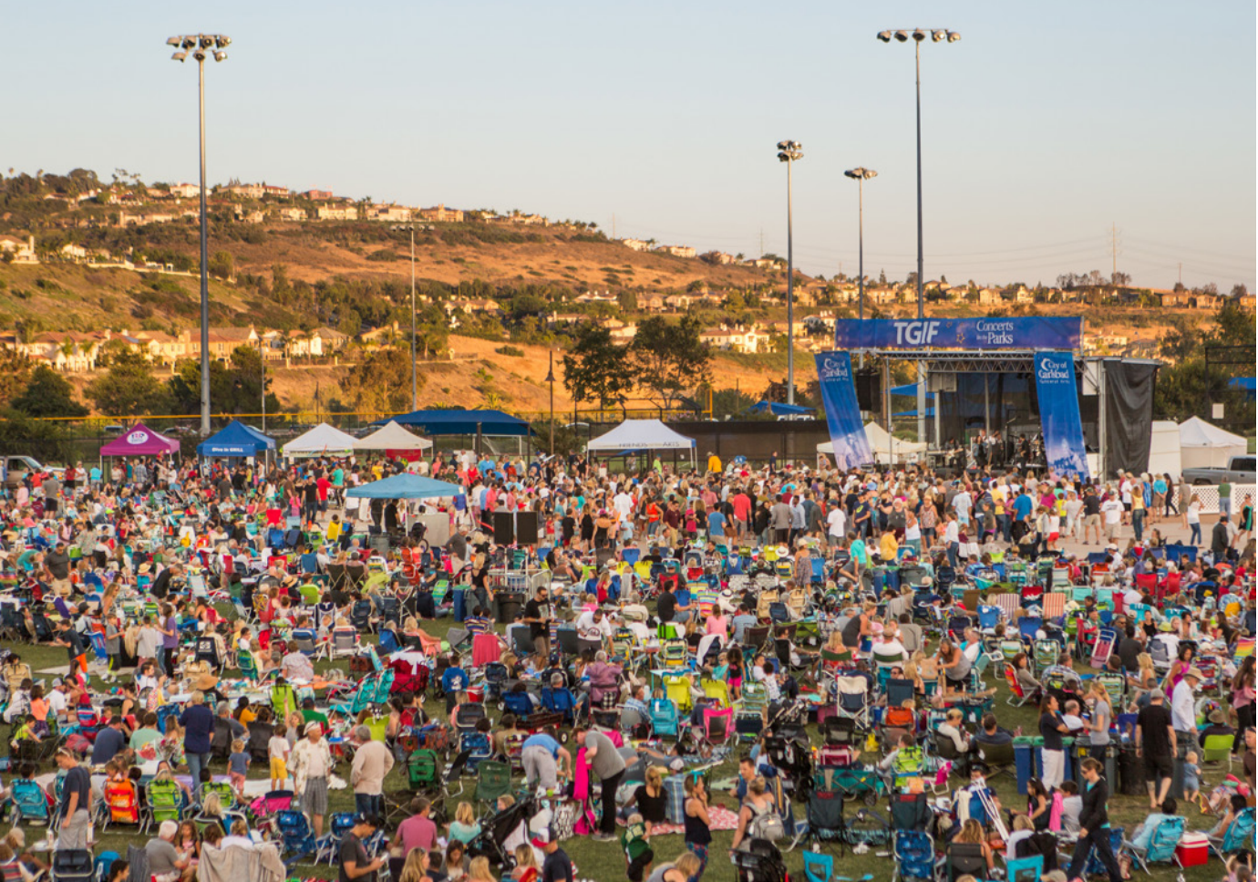
It's official, TGIF Concerts in the Parks is back in-person this summer 2022!