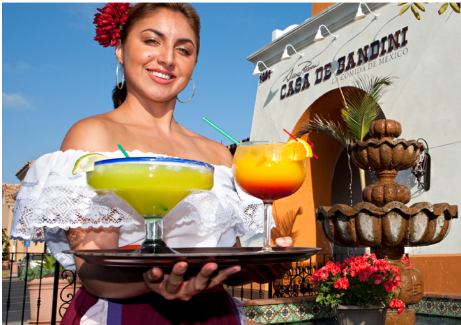
Casa de Bandini offers delicious margaritas in three generous sizes, from 17 to 32 oz. glasses in various flavor options.

The menu features authentic dishes made with the freshest ingredients and original regional recipes, including favorites such as the Tequila Lime Shrimp, shrimp sauteed with tequila, lime and butter; seasoned garlic, crushed chili and cilantro; Carnitas a la Michoacán, slow roasted succulent