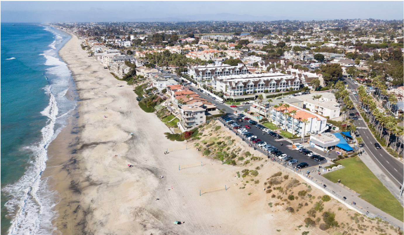
From the beaches to the Flower Fields, tourism is continuing to rebound strongly in Carlsbad.

Spring Break, however, has been very generous to Carlsbad. Visit Carlsbad recently shared that occupancy rates in March, 2022 were 75.5%. That is nearly identical to what it was in 2019, which saw occupancy at 76.5%. The ADR, however, was stronger in March, 2022 than in March, 2019. This