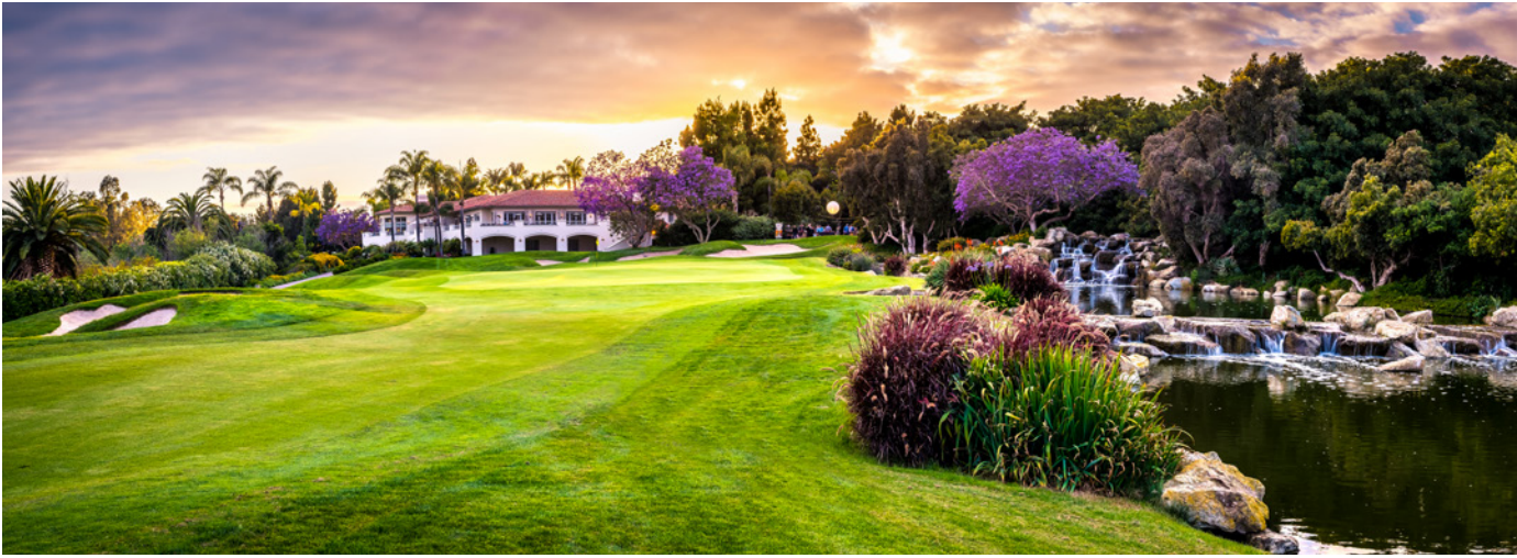
Breathtaking views of Park Hyatt's Golf Course.

Fun fact: Park Hyatt Aviara has the only 18-hole golf course designed by the famed Arnold Palmer in the entire San Diego region. You'll also see no fewer than 50 varieties of flowers on this course, making its landscaping more like a botanical garden.