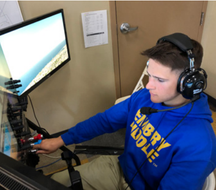
Students learning hands-on in Computer Science and Aviation classes.