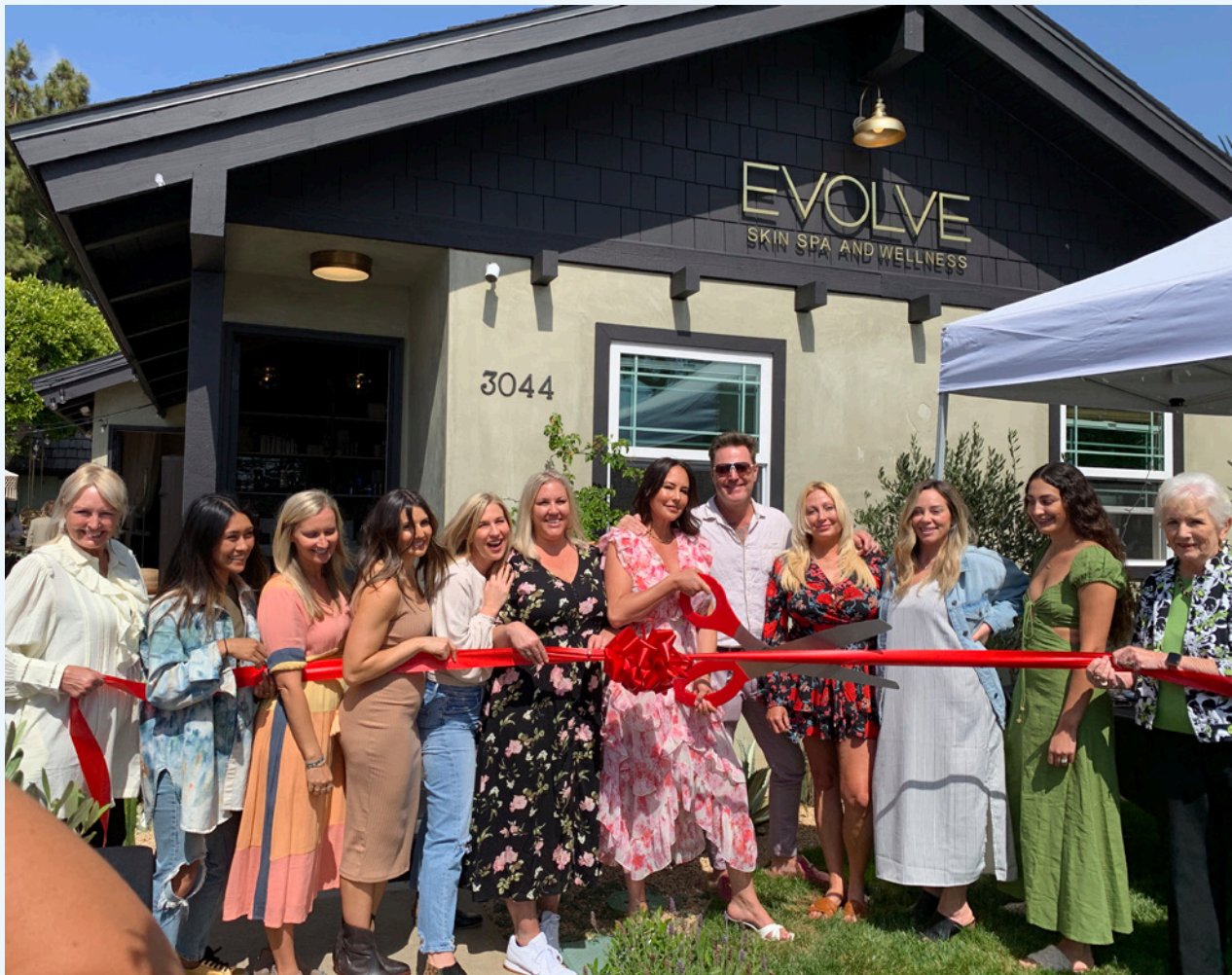
Congratulations to Evolve Skin Spa and Wellness on their Grand Opening in Carlsbad. Evolve offers custom treatments using top-of-the-line products to address any skin care goal. Book a treatment at www.evoveskinspa.com