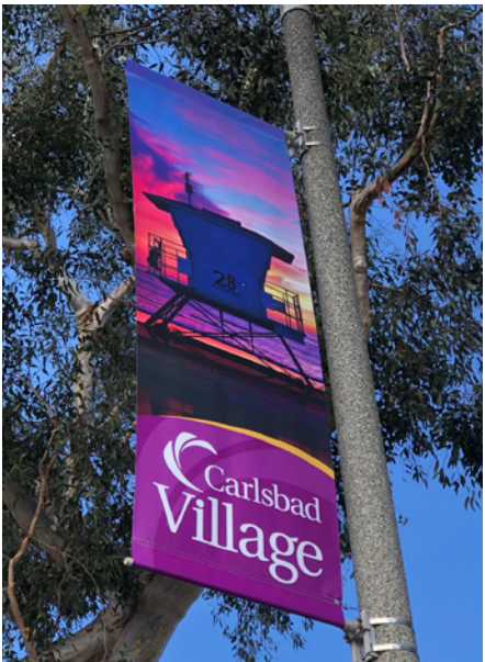
Carlsbad Village tower 28 flag.

For Stay & Play inspiration in Carlsbad Village, visit carlsbad-village.com .