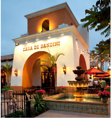
Casa De Bandini boasts an extensive menu of delicious flavors amidst a vibrant dining atmosphere reminiscent of Old Mexico.

In addition to authentic food and décor, Casa de Bandini hosts live mariachi performances. Request your favorite Mexican song or a birthday serenade from these world-class strolling musicians every Thursday to Saturday from 5:30–8:30 p.m. and Sunday from 2–5:30 p.m.