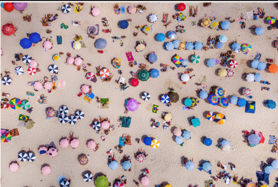
Tourism is back, Carlsbad is Calling.