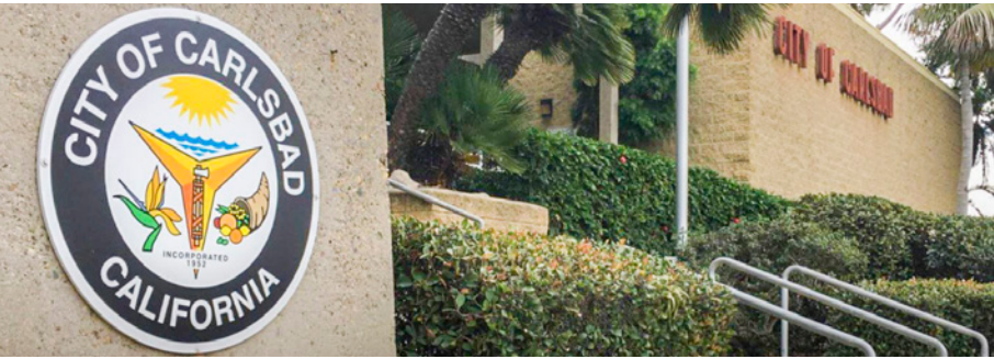
The City of Carlsbad is the first city in San Diego County to join the California Green Business Network, a statewide network of 4,000 certified businesses in 40 cities that are committed to environmentally sustainable practices.