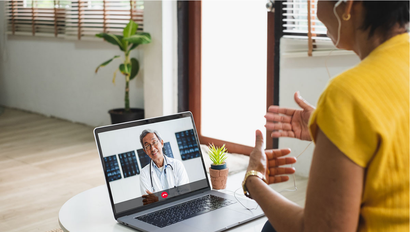
Virtual care visits are similar to in-person visits with your doctor or another member of your health care team.