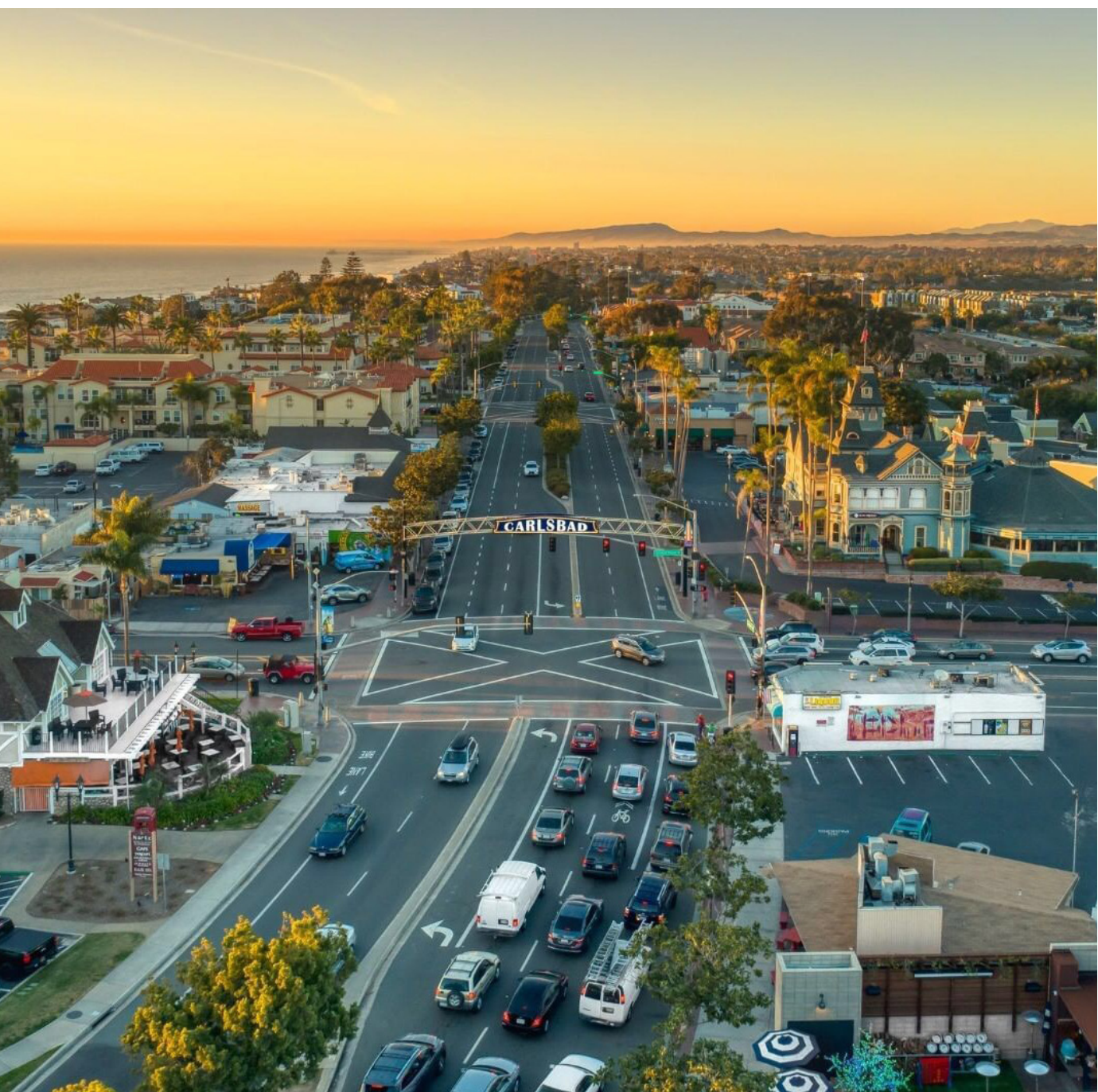
Aerial view of Carlsbad Village at sunset.

What would a staycation be without lodging? Look no further than the coast. Carlsbad Inn Beach Resort , Beach Terrace Inn , and Tamarack Beach Resort offer beach views, beach access and the beach lifestyle. Just a few hours on one of these properties and you will be glad you stayed. The experience of going to sleep and wak-