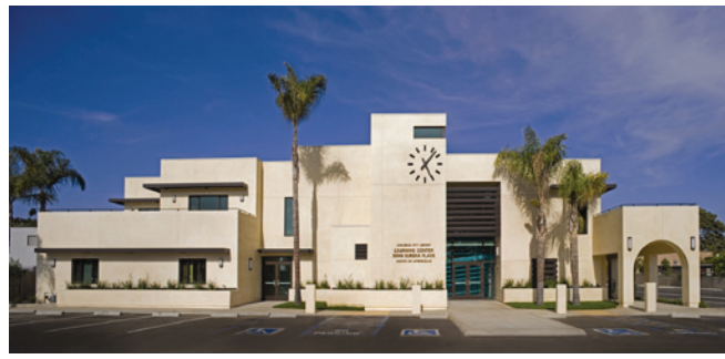
BEFORE: West Wall, Library Learning Center, 3368 Eureka Place, Carlsbad, CA 92008

As the facilitator of the project, I was in awe of the finished artwork, titled "The Sun