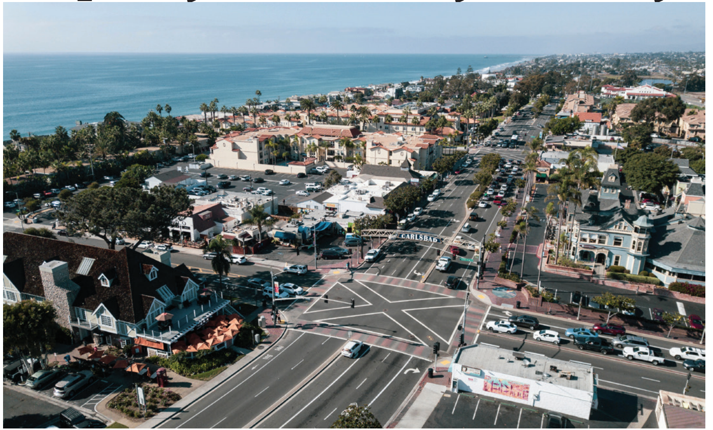
Check out 8 ways to stay and play in Carlsbad's charming coastal community.