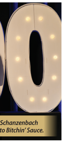
Schanzenbach to Bitchin' Sauce.