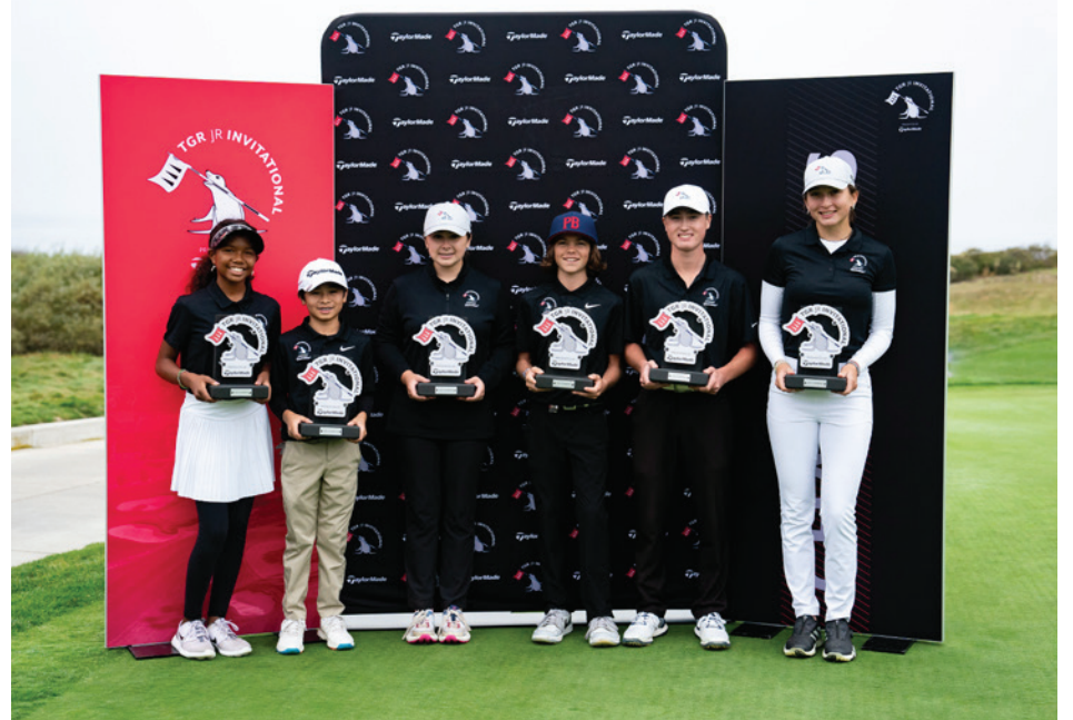
In partnership with Tiger Woods, the TGR JR Invitational presented by TaylorMade provides a group of young golfers with the opportunity to compete at Pebble Beach.