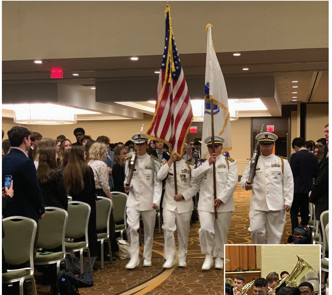
Harvard Model Congress Opening Ceremony.

The fall looks to be busy as well. We are expanding our Aviation Program to include