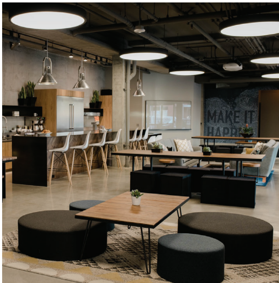
CommonGrounds Workplace offers 10,000 sq ft of private offices and shared desks, eight fully-equipped conference and phone rooms, and a shared kitchenette with unlimited coffee.