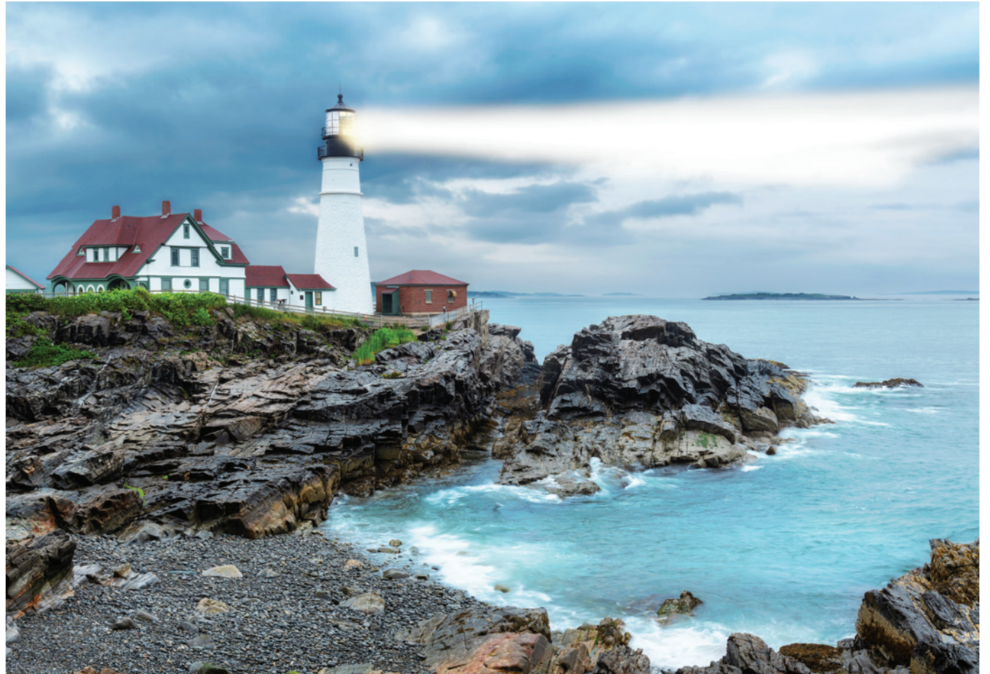
Financial planning sounds complex. Compare it to sailing from New York to London. Whether you're navigating to Europe, Asia or parts unknown, we're here ready to assist you.

Avoid complexity as it leads to inaction. Gradually act on a prioritized list of advice