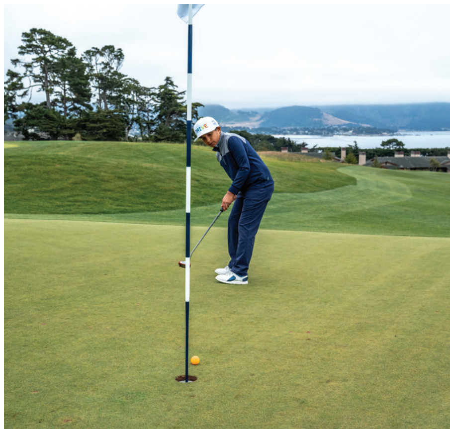
A TaylorMade DRIVE Club member putts on the ninth green at The Hay at Pebble Beach.