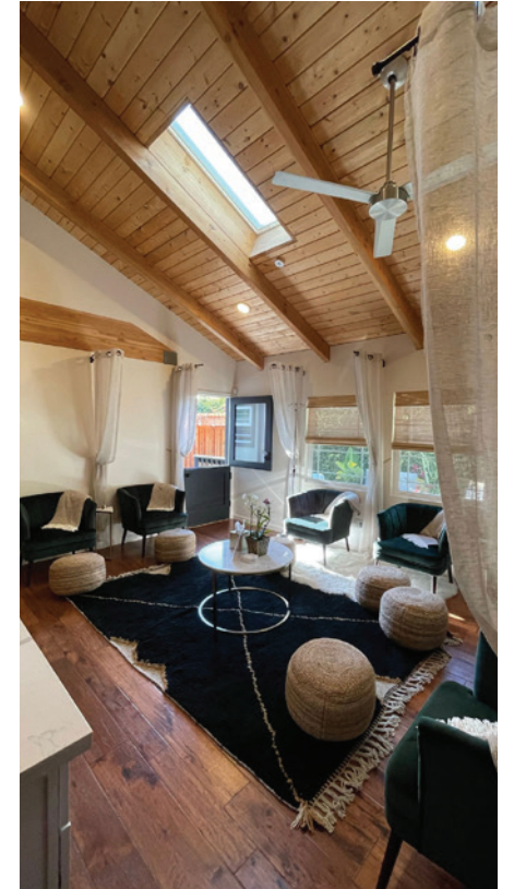
Evolve Skin Spa and Wellness offers a range of beauty services in a relaxing environment in Carlsbad Village.