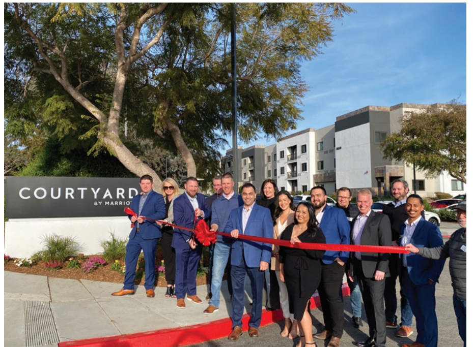
Over the last 3 years alone, at least 4 of our major hotel properties have undertaken large scale remodels or expansions, including Courtyard by Marriott.

We are fast approaching the 50th anniversary of the launching of the Carlsbad