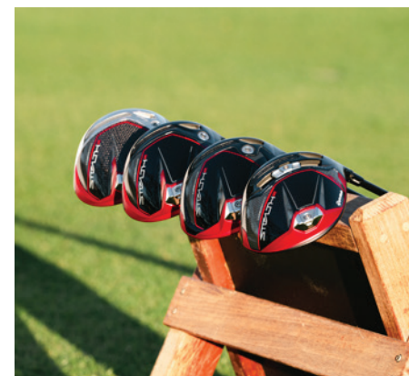
The current family of Stealth 2 drivers features the revolutionary 60x Carbon Twist Face and signals a dramatic material shift in driver design.