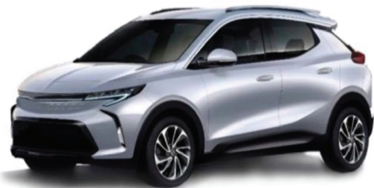
BUICK ELECTRA EV