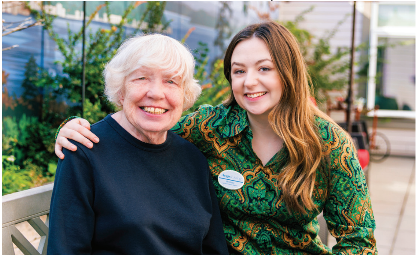
Aegis Living Shadowridge welcomes those who need everything from light assisted living to more robust memory care, and offers transitional assisted living for those with a recent diagnosis.

ever, one of the most important things you can do is get the help you need from family or friends—or professional support if the time has come. There are in-home care options, assisted living, respite stays, and more.