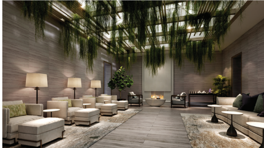
Miraval Life in Balance Spa Aviara will be coming soon to the Park Hyatt Aviara. Stay tuned!