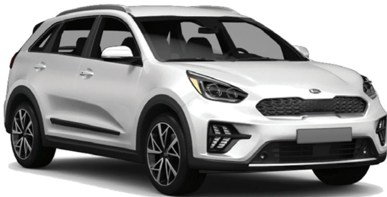
KIA NIRO EV