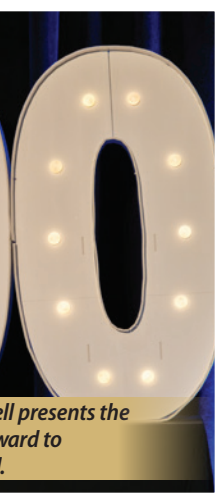
...ll presents the ...ward to ...

CBAD CARLSBAD BUSINESS ACHIEVEMENT & DISTINCTION Awards 2023 | LUNCHEON