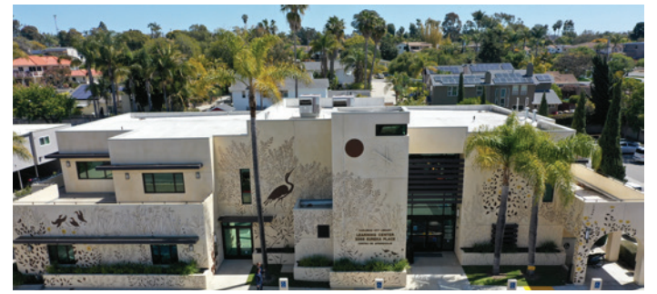
AFTER: Studio Tutto, The Sun & The Egret, 2023, acrylic paints