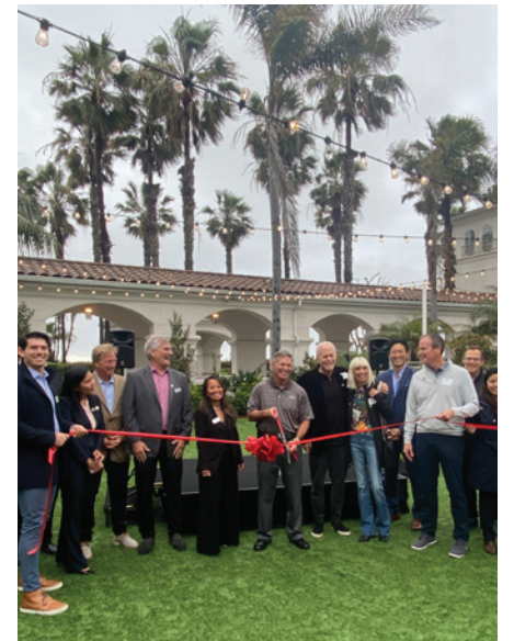
The Hilton Garden Inn Carlsbad Beach has completed a $10 million renovation of its guestrooms and public spaces.

am proud of is that our hotel partners do not just collect their profits for themselves. They continue to reinvest in their offerings and in our city. Over the last 3 years alone, at least 4 of our major hotel properties have undertaken large scale remodels or expansions. These include the Park Hyatt Aviara in 2021, The Courtyard by Marriot in 2023, The Hilton Garden Inn in 2023, and The Omni La Costa currently to name a few. By not resting on their laurels and continuing to create better and more attractive offerings for both business and personal visitors to our fine city; our tourism industry will continue to thrive. Their success leads to a direct benefit to all of us who have come to expect the best from Carlsbad!