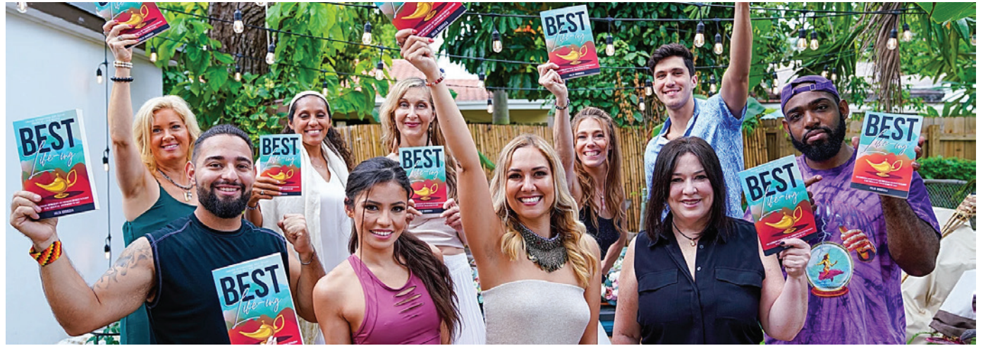
Best Life-ing located at the Omni La Costa Resort & Spa offers wellness in a variety of ways. Check out their retreats, hypnotherapy, and 80+ healers, teachers, and coaches for a truly custom experience.

From estheticians to massage therapists to mindfulness coaches and neuro-linguistic practitioners, we have so many ways to summertime wellness in Carlsbad. Reminder to stay hydrated with some Carlsbad Alkaline Water and reapply COOLA sunscreen every 2 hours. And don't forget, when taking care of your business, your business also includes being your best inside and out, so gift yourself a wellness experience this summer.