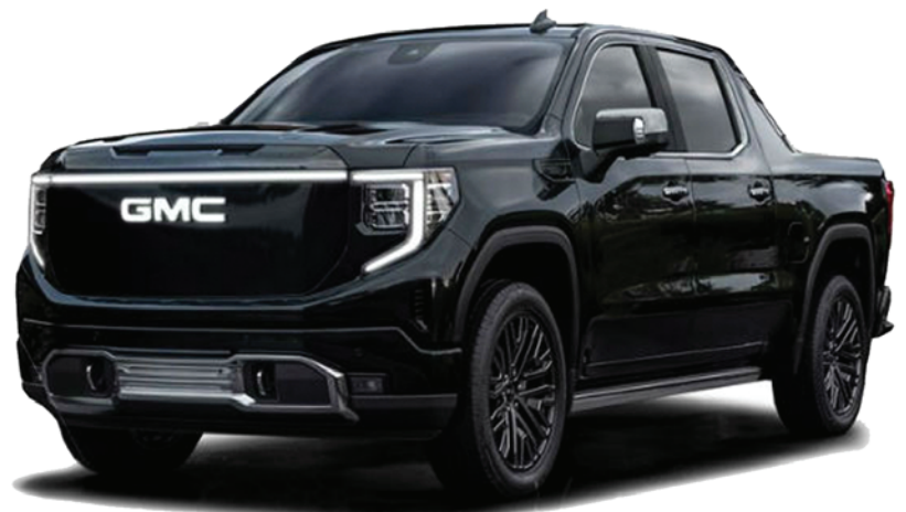
GMC SIERRA EV