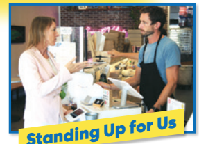
Standing Up for Us