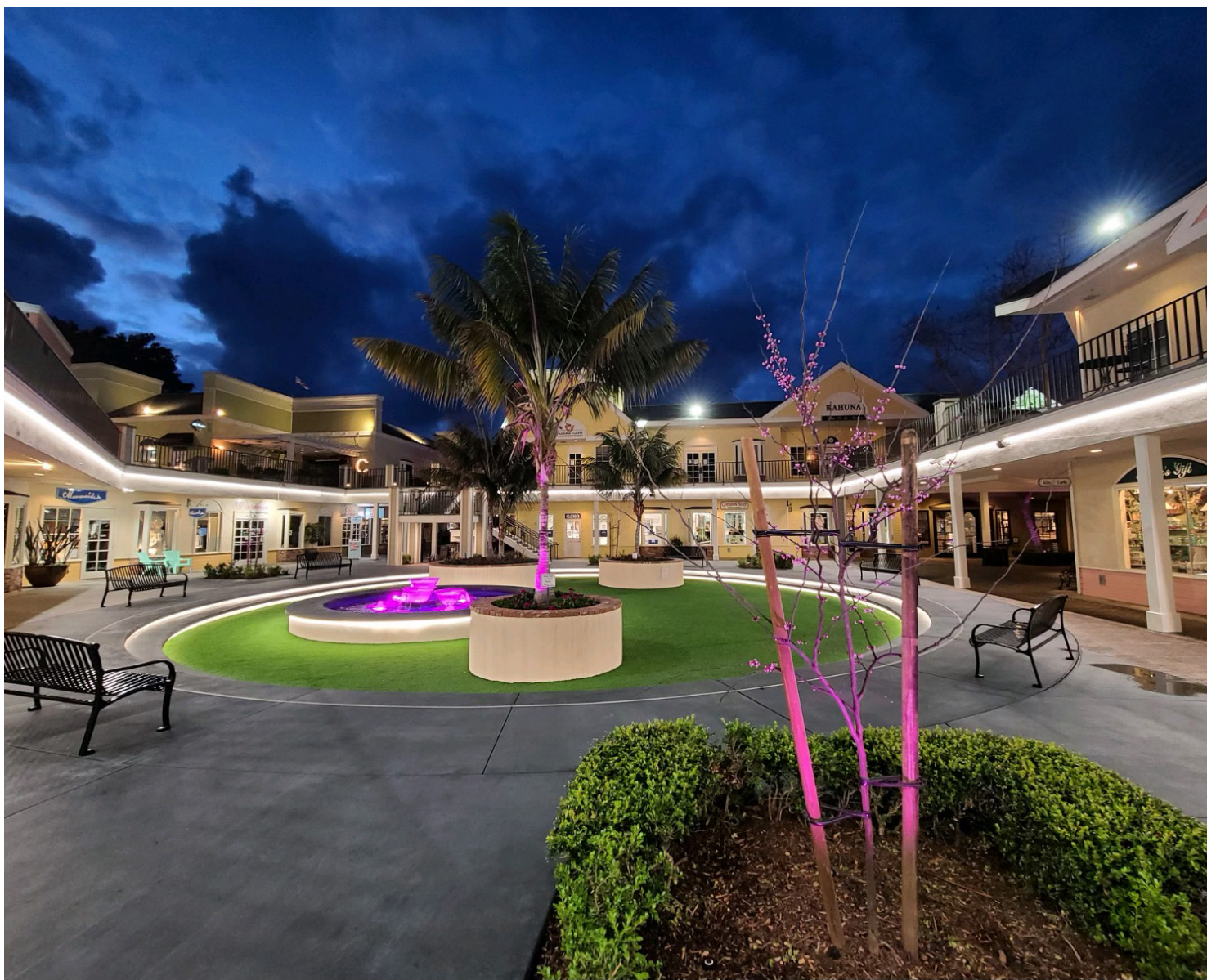
Restaurants and shop surround a family friendly fountain courtyard that lights up in the evening.

For more information go to: www.shopvillagefaire.com/