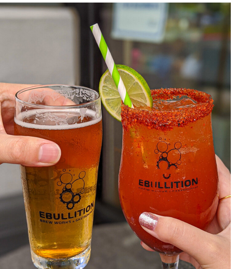
The Ebullition Michelada made with our own crafted Habanero lager