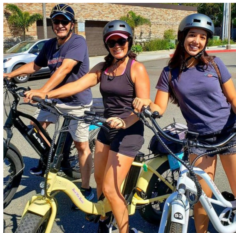
Beach Vibe Rental offers different colors, sizes, and styles for individual riders, and e-bike rentals include a bag, helmet, lock, and e-bike tutorial.

Glow Theory Dermatology-Studio is located at 7750 El Camino Real ste F Carlsbad, CA 92009. P:(760) 264-9466