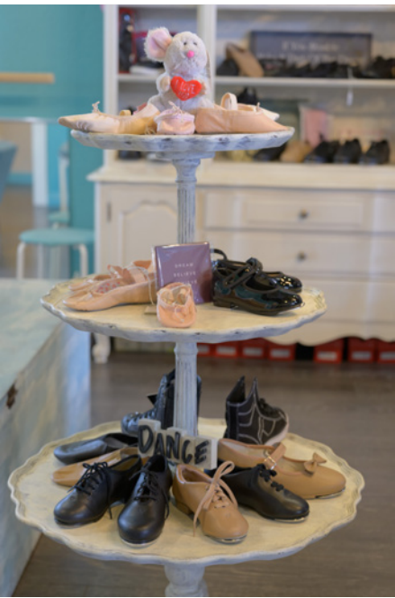
As winter shows approach again this season, Dancin's Soul is keeping stock in all the basics as well as new beautiful fashion for dance class and auditions.