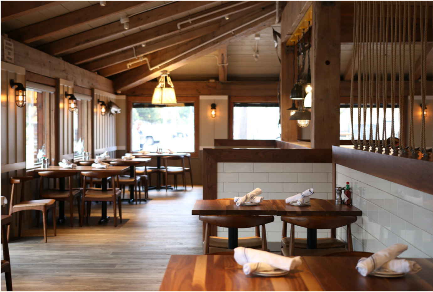
Chef Albert Serrano is introducing lunch and dinner dishes that leverage Bluewater's access to up to 40 varieties of fresh sustainable seafood and shellfish.

Like all Bluewater neighborhood locations, Bluewater Grill Carlsbad is committed to not only serving the freshest seafood