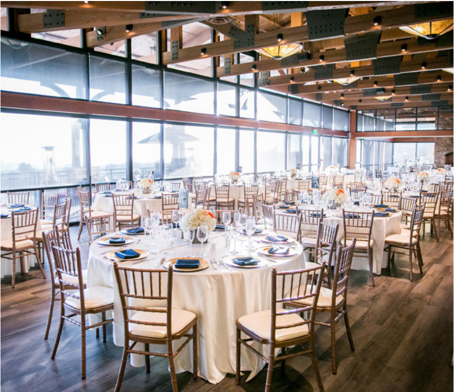
The Crossings at Carlsbad is a premier public golf course, restaurant, wedding venue and private event facility. With stunning ocean views from the restaurant, clubhouse and golf course this is the perfect place for any holiday event.