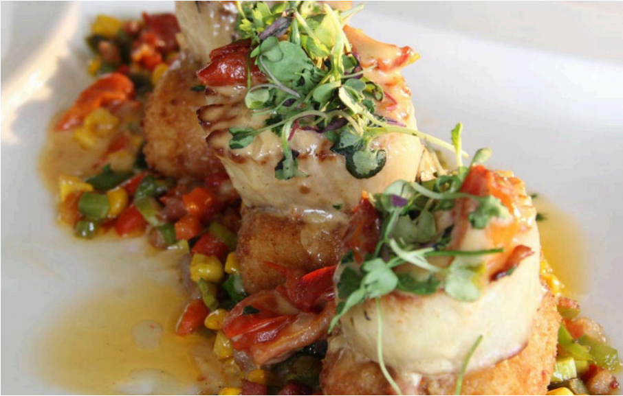
Vigilucci's offers full-service catering with customized menus and staff to suit every occasion and group size.