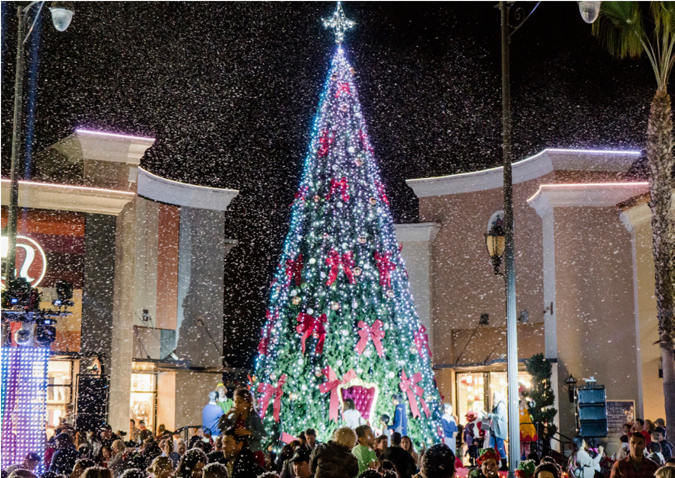
Many small businesses in Carlsbad Village are currently short-staffed and actively hiring for different positions.

Join Chabad La Costa for the Lighting of the Menorah in the Courtyard between Chico’s and White House Black Market. The event will include games for the children and complimentary refreshments.