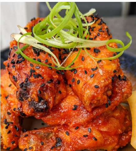
Korean hot wings tossed in gojujang sauce and served with miso ranch dressing