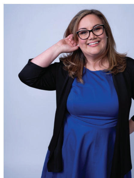
Hearing loss is an invisible disability that may reduce quality of life and lead to serious health issues including developing dementia, depression, mental fatigue, and cognitive decline.

HearingLife's licensed professionals have in-depth knowledge of treating hearing