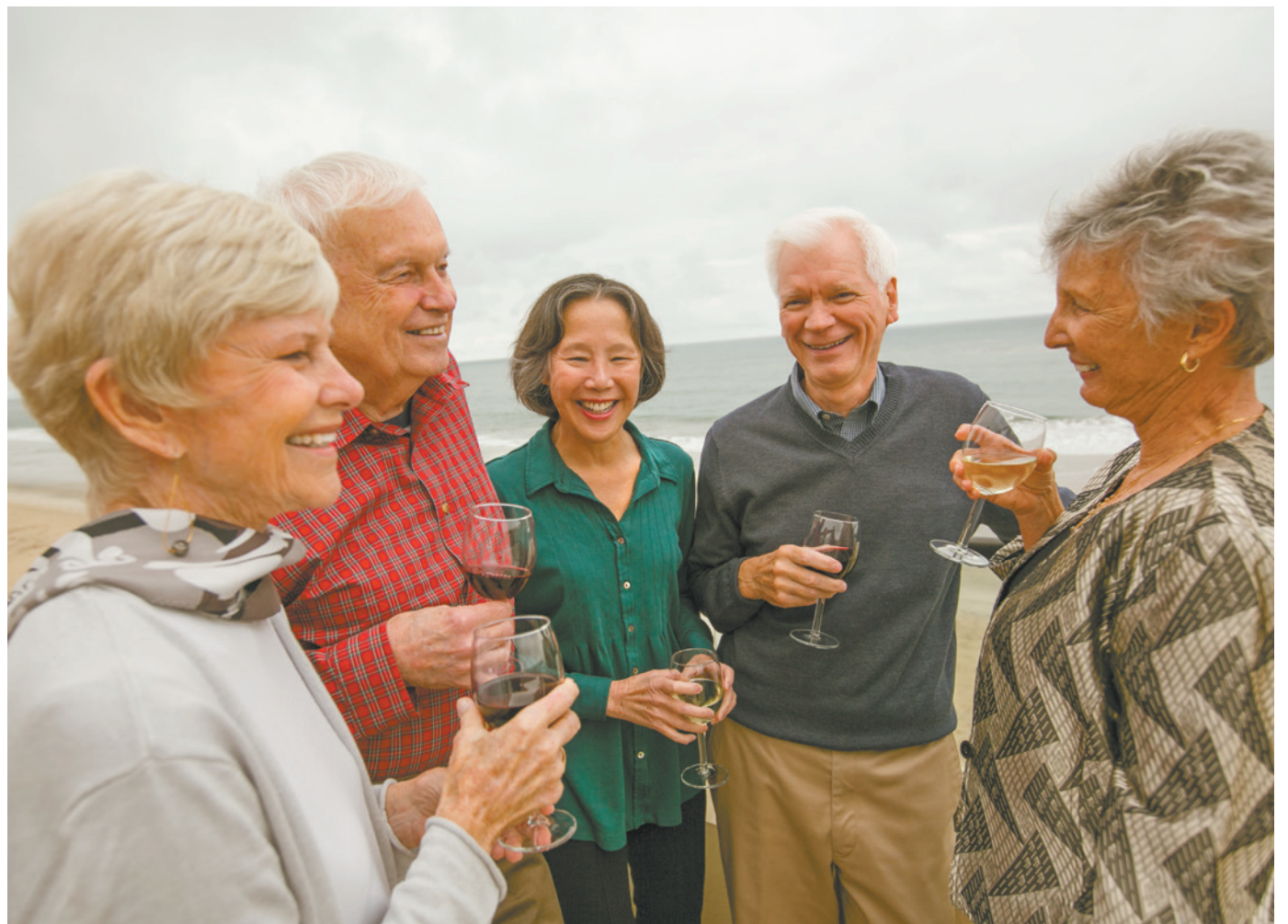
At Carlsbad By The Sea, life is enriched by not just social opportunities but ease, as our attentive staff manage the essentials — housekeeping, maintenance and culinary delights in our picturesque dining room that looks out to ocean vistas.

As a continuing care community, we evolve with your needs. 'Truly Yours' personal care brings assisted living services right to your doorstep, ensuring comfort without compromise. And should you require