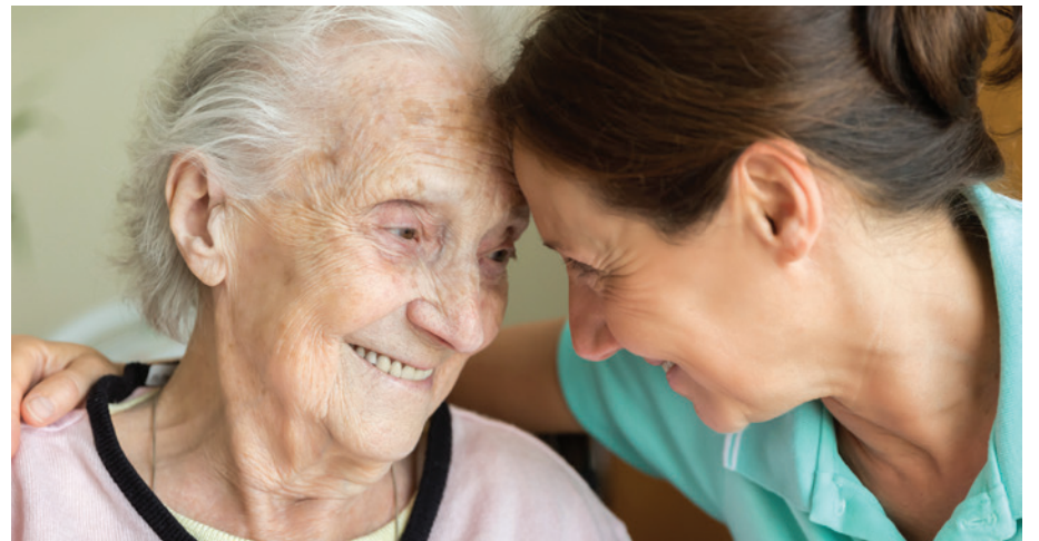
Arosa, a premier provider of Care Management and Caregiving services, is focused on supporting individuals to embrace their journey by championing change through comprehensive support, expert guidance, and personal care navigation.