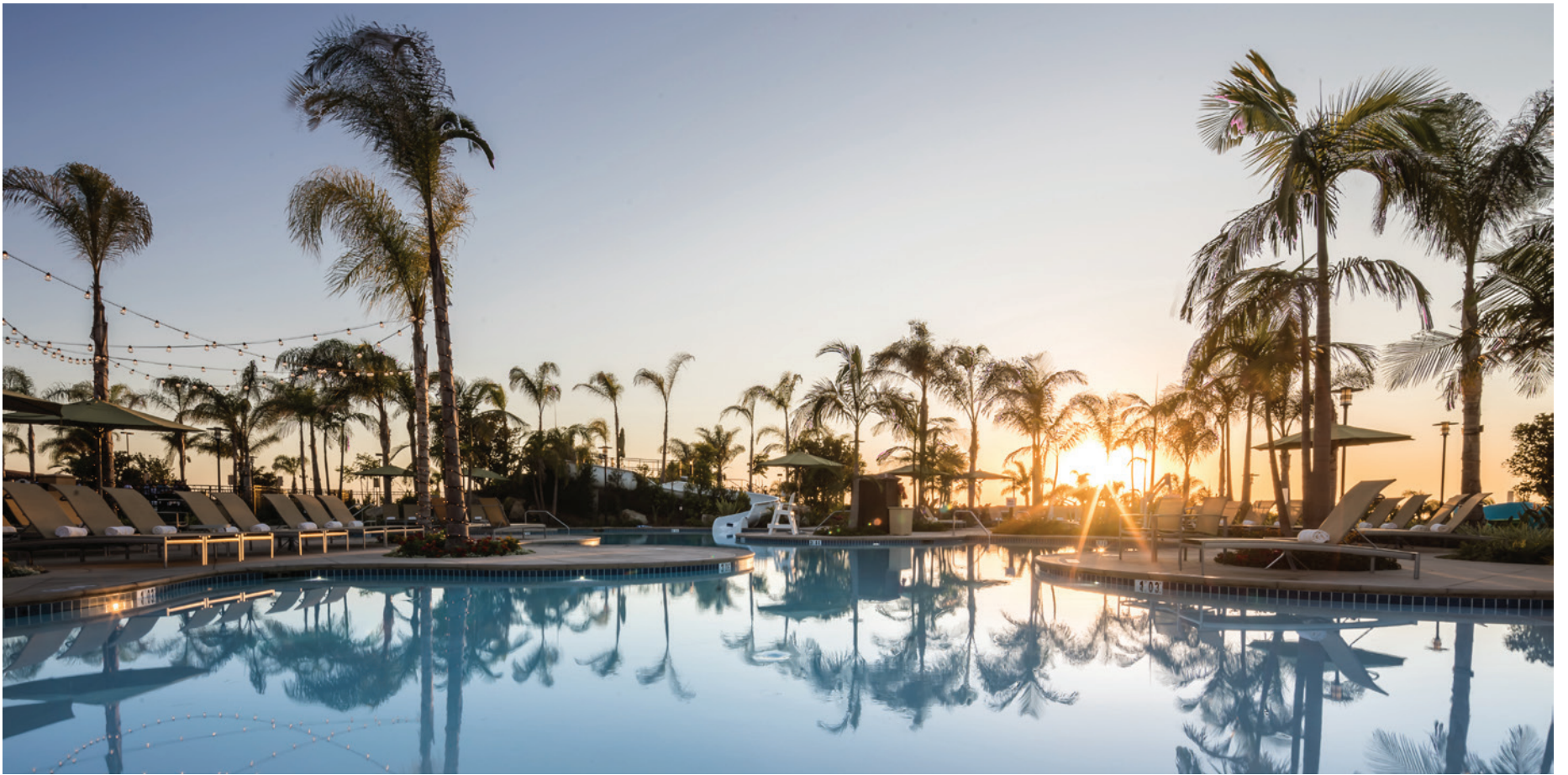
A vacation in Carlsbad is great for visitors and locals alike. We have tons of amenities to spice up your relaxation with fine dining on a coastal property and a renovated spa.