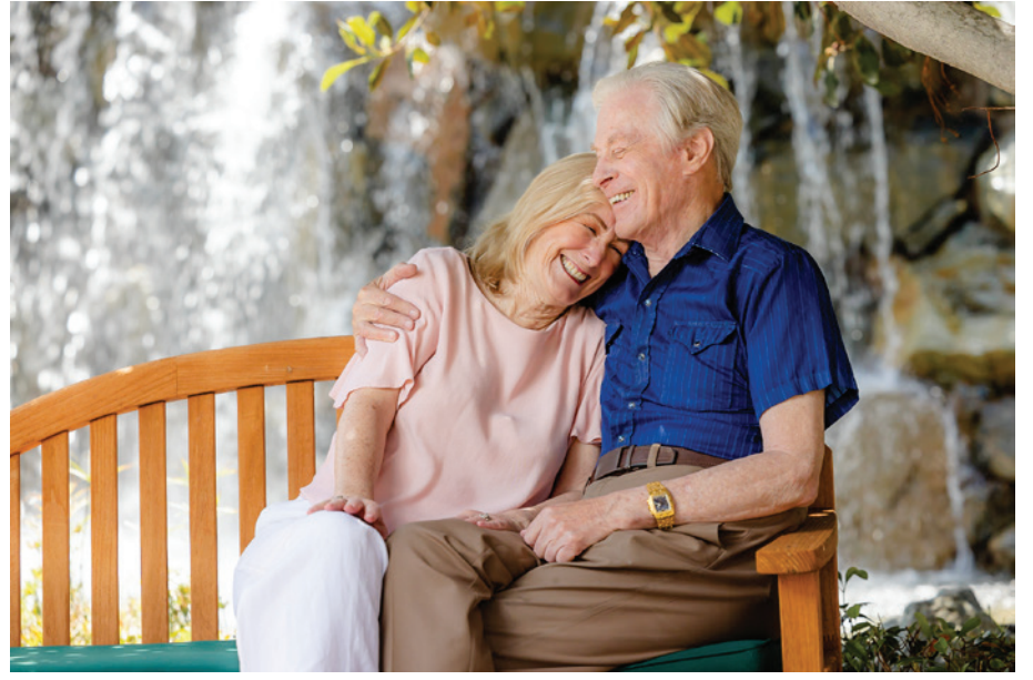
Located in Carlsbad, La Costa Glen is a Continuing Care Retirement Community (CCRC) dedicated to making a difference in its residents' lives.