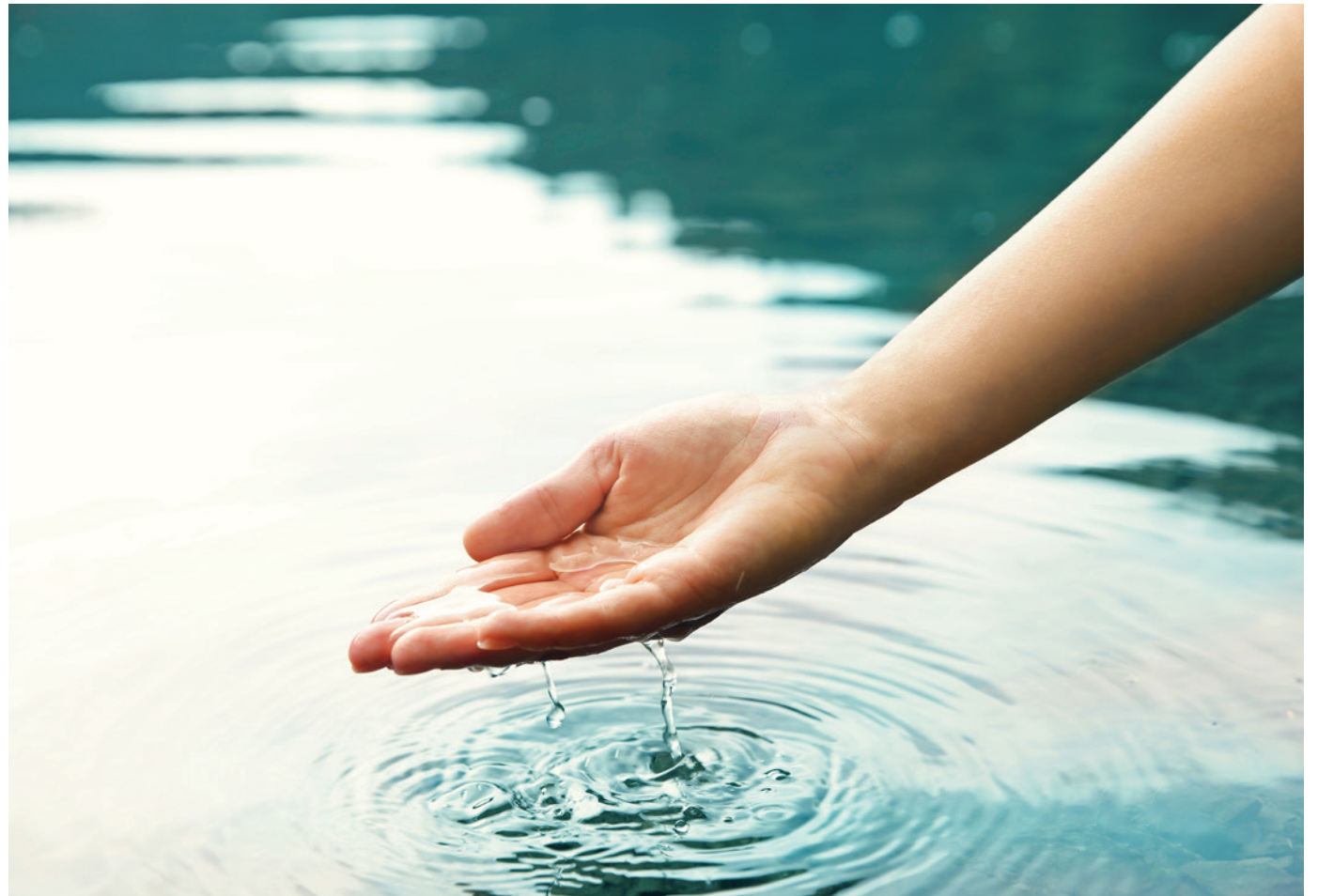
Alkaline Hydrolysis (Aqua cremation) is a gentle, warm, water movement that washes over your loved one.

Alkaline Hydrolysis (Aqua cremation) is a gentle, warm, water movement that washes over your loved one. This process is fully electric and produces zero emissions. It is a