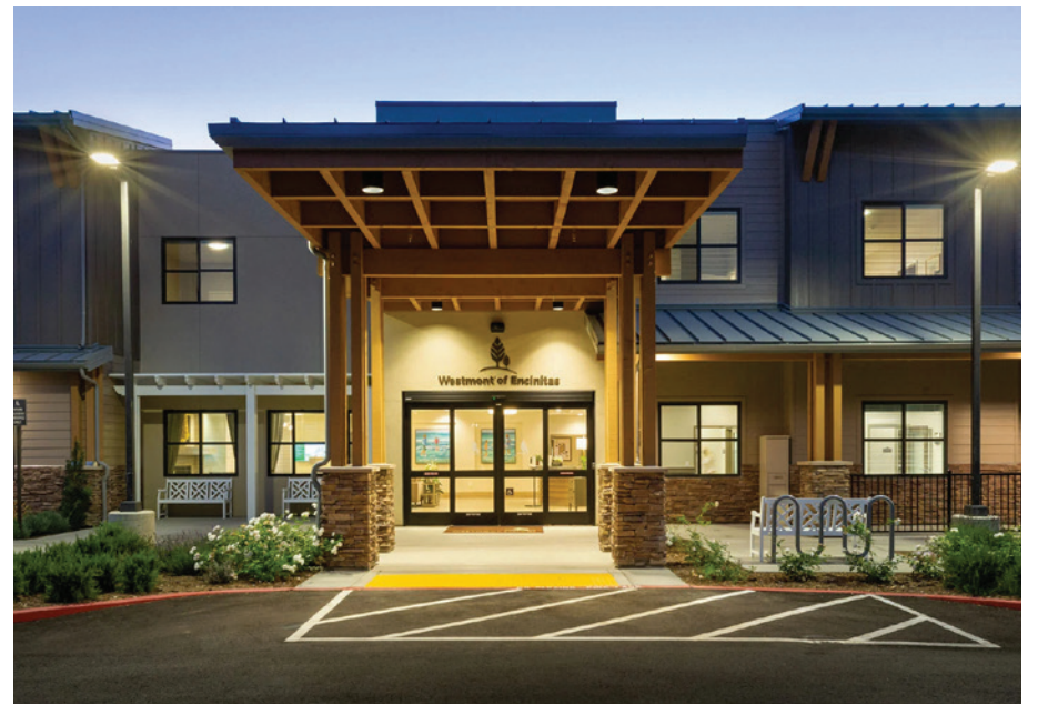
Westmont Living offers support for couples with varying health needs and enables residents to lead full and enriching lives.