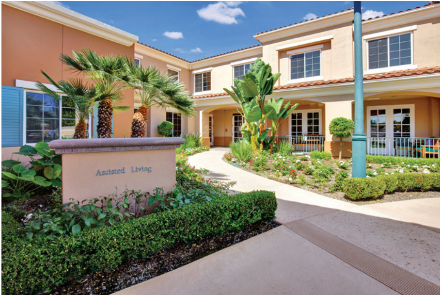
Located in Carlsbad, GlenBrook Health Center is a well-respected senior care provider nestled among the rolling hills and provides beautifully landscaped grounds to enjoy.