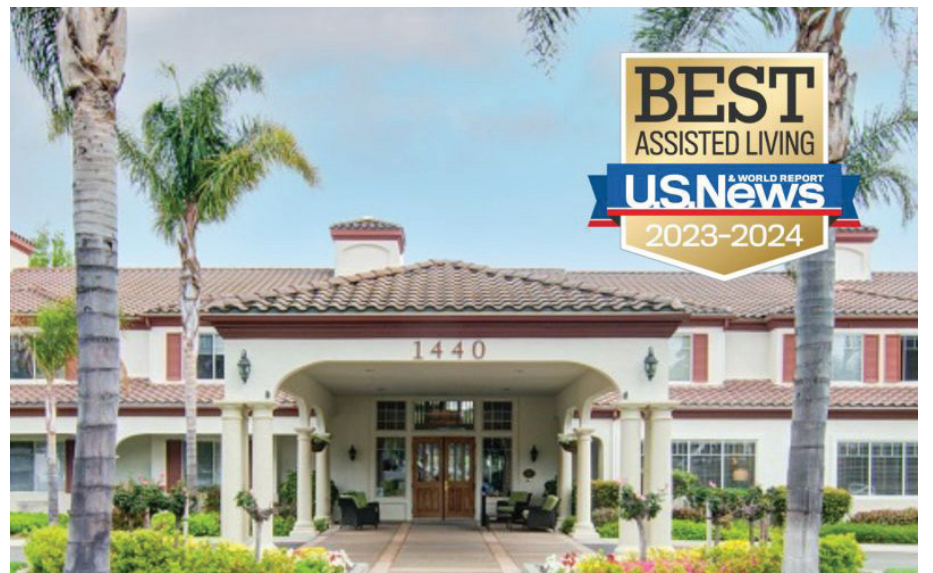
At Aegis Living Shadowridge, residents live in private apartments and enjoy concierge services, housekeeping, laundry, transportation, movie theater, a beauty salon and more.

1440 South Melrose Drive | Oceanside, CA 92056 760-806-3600 | aegisshadowridge.com