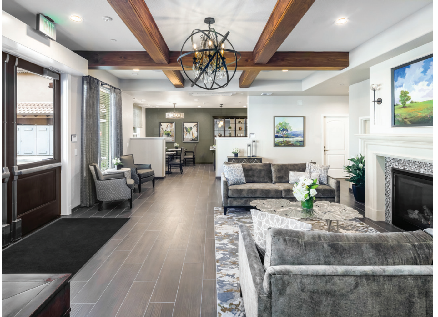
Just steps away from the main building on Santianna's campus, Vienna offers a customized program to memory care.

Studies show that using a team approach results in healthier dementia residents—and relieves stress on families! Our staff will work with physicians, the resident's health care providers, volunteers, community groups, and family members to care for the needs of the whole person. Family members are important partners in creating the "best life" for our residents. We support our families through resource libraries, family councils,