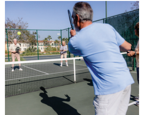
your visit to La Costa Glen by calling 760-691-2769. The dedicated team would be happy to introduce you to the residents who are proud and excited to call this Carlsbad community home.

If you're interested in experiencing retirement living options on your terms in 2024, schedule