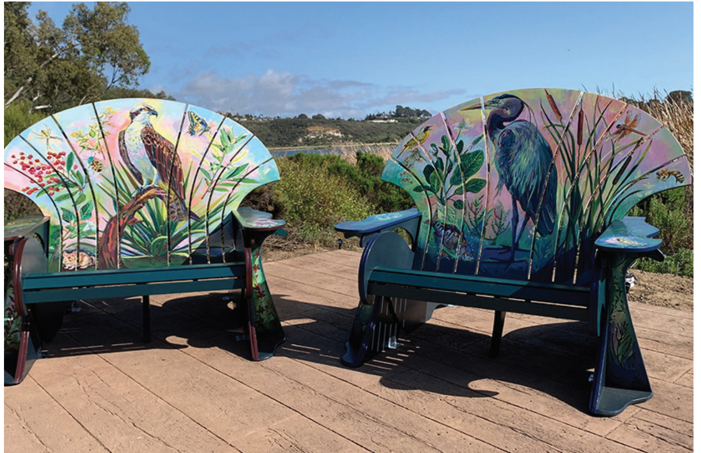
The City of Carlsbad Cultural Arts office has been working with an art preservation specialist to assess the maintenance needs of the city's permanent public art collection.

Staff has been working with CalTrans and SANDAG on the public art element to be incorporated into the Chestnut Underpass of I-5. A Public Art Advisory Subcommittee, consisting of two community members, two arts commissioners, and one arts professional with ties to the Barrio community have selected Los Angeles-based artist team, Greenmeme, for this project. A Call for Artist Qualifications will be released this spring, seeking California-based professional artists for a public art element to be installed in a new traffic roundabout in the Barrio community. An in-person community workshop, attended by 12 Barrio residents, was held in December to gather feedback on the project. The first Public Art Advisory Subcommittee meeting for public art in Veterans Memorial Park taking place over the next few months, where nearby residents and representatives of the armed forces and veterans will hear from qualified artists, in order to finalize an artist selection.