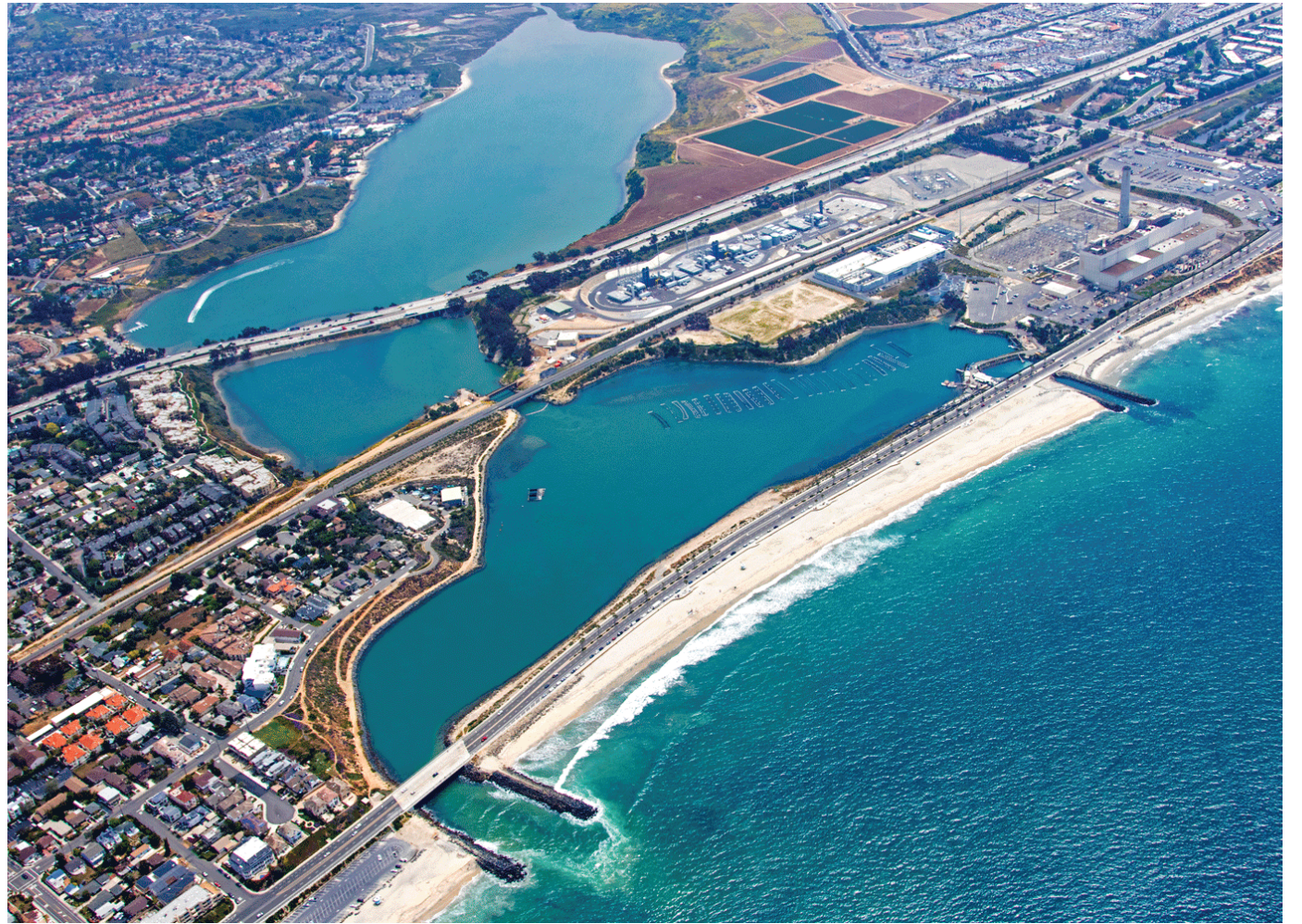
The Carlsbad Desalination Plant has produced more than 110 billion gallons of high-quality drinking water for San Diego County residents – enough to keep water surging over the Niagara Falls for nearly 48 hours!

As a result of the approximately $274 million investment in a new state-of-the-art intake system, the Carlsbad Desalination Plant