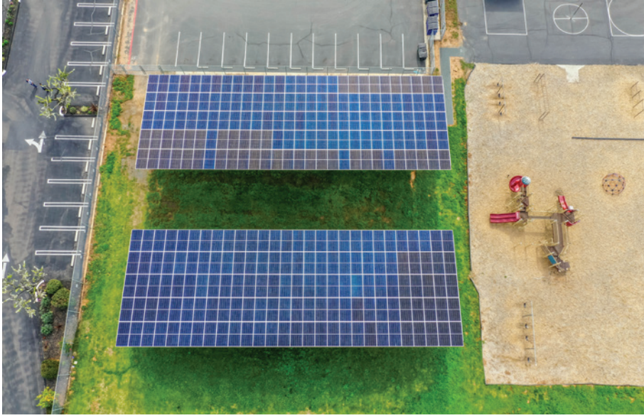
Solar installations can do more than generate power, this recent EVA Green Power installation also provides much-needed shade for schoolchildren out on the playground.