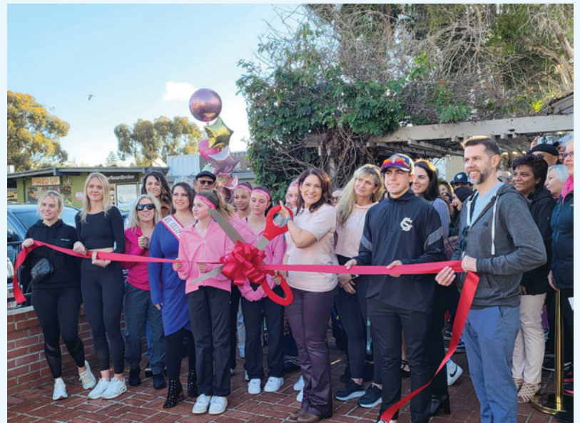
Congrats to Kaia FIT North County on the Grand Opening!