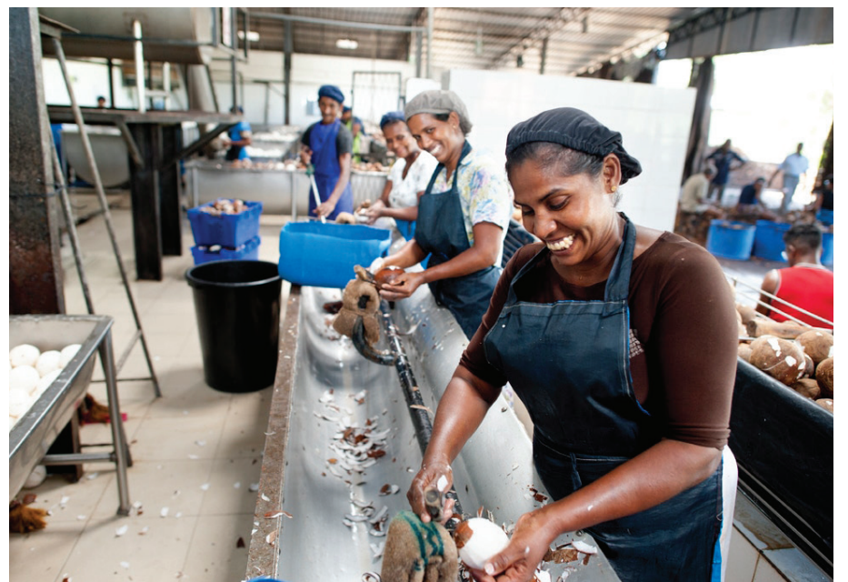
Regenerative Organic Certified Coconut oil production at Serendipol in Sri Lanka.