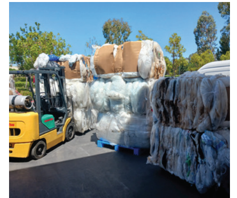
Plastic Beach has collected and reclaimed nearly 50,000 lbs. of this hard-to-recycle plastic.

“ECOLIFE Conservation’s aquaponic growing methods use up to 90% less land and water compared to traditional agriculture while providing a consistent source of fresh protein through fish rearing and harvesting—serving to combat both climate change and food insecurity. We’ve recently designed a solar-powered and scalable, Modular Aquaponics Response Kit (M.A.R.K.) which can be packaged into a shipping container for easy and rapid deployment to global communities. Equipped with more than 420 square feet of grow space, end-users can plant a wide variety of greens to fit the needs of their community or business.”