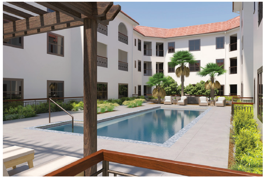
Discover coastal senior living at Hacienda Mission San Luis Rey in Oceanside. Find Independent living, assisted living, memory care, and short-term stays.