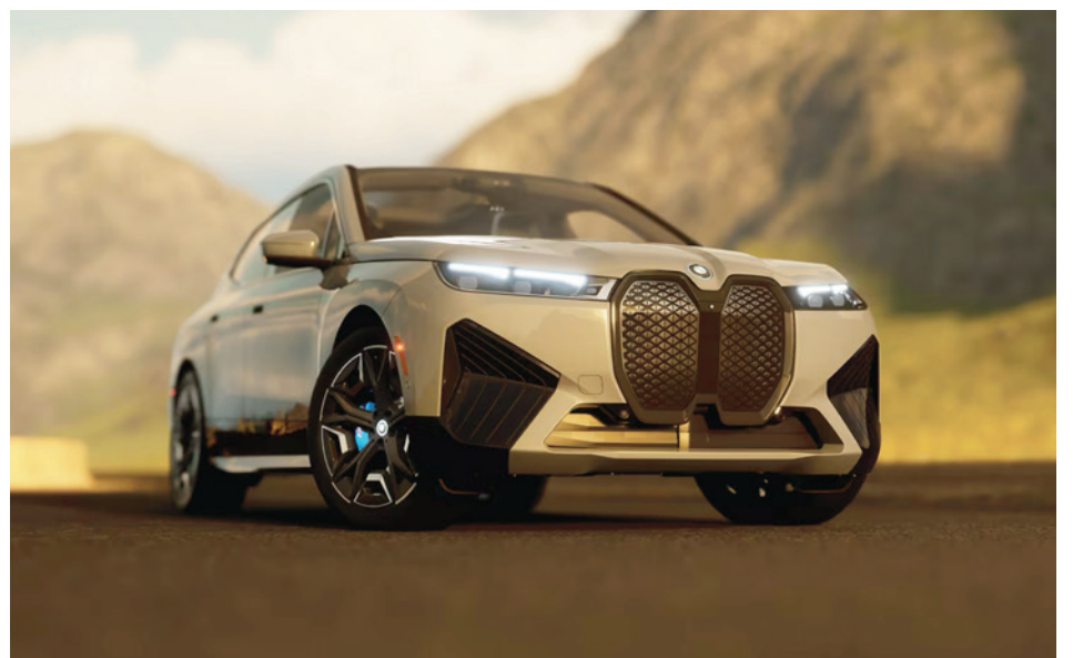
BMW of Carlsbad has an added focus on BMW all-electric models.

Staying true to BMW's performance legacy, this sustainably designed all-electric line-up of vehicles embodies the ideal blend of luxury, technology, and power. They are fun to drive, due to instant torque and linear acceleration of the electric motor. In fact, BMW EVs have as much torque from complete standstill as at high speed. All BMWs are about balance,