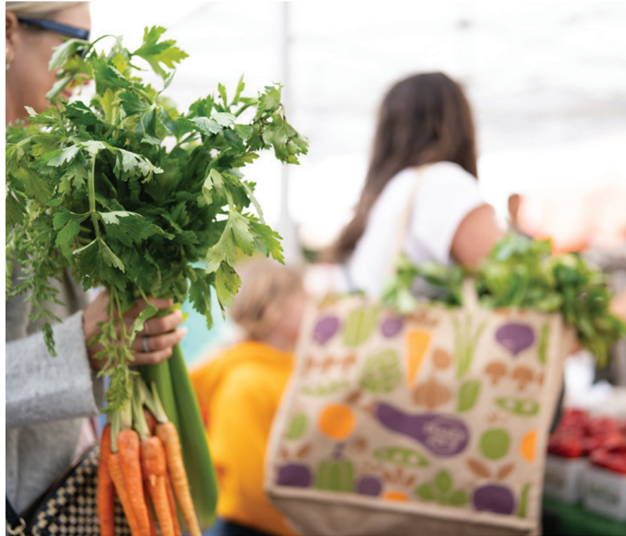
At the State Street Farmers Market, the biggest change you will notice is that you will no longer be able to take your goodies home from the market in a single-use plastic bag.

Assembly Bill 1276 is a California state law, sometimes referred to as "Skip the Stuff."