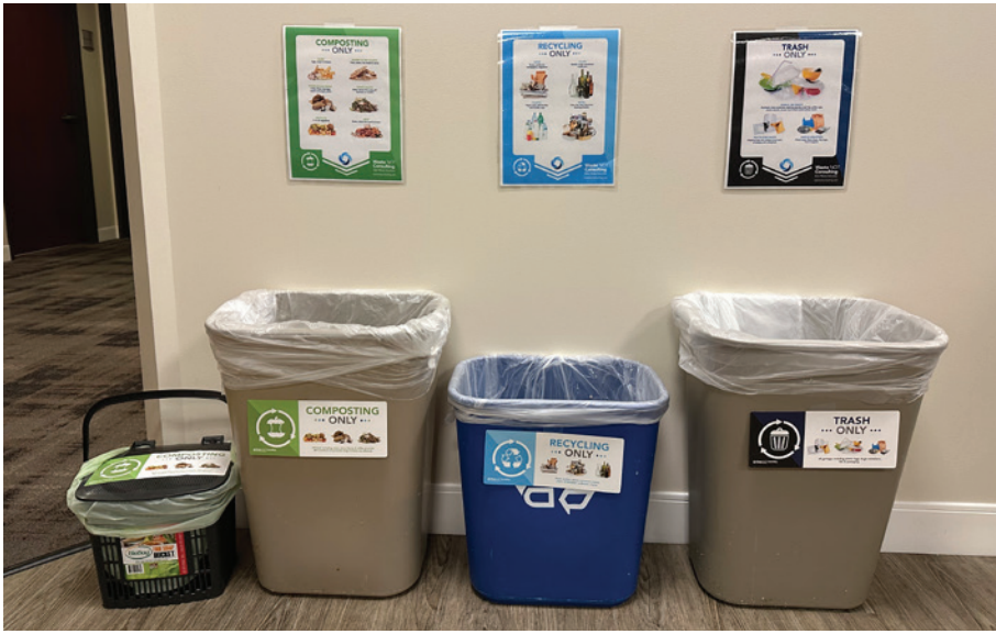
Join Waste Not Consulting for an April workshop series and learn how to create or revitalize a recycling program in your workplace.