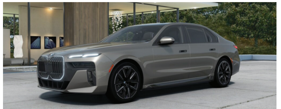
New 2024 BMW i7 eDrive50