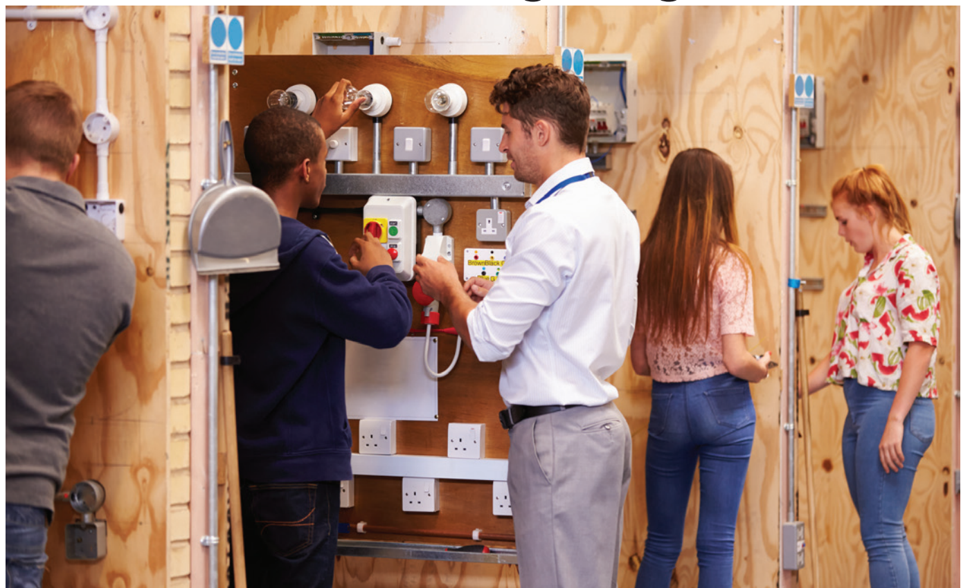
MiraCosta College's recent strides in sustainable education are an exciting step forward in environmentally conscious career training.

Complementing the Electrician program is the HVAC program, a central feature of MiraCosta's green workforce development strategy. As climate change accelerates, the demand for energy-efficient heating, ventilation, and air conditioning systems is on the rise. The HVAC program not only equips students with the technical know-how to excel