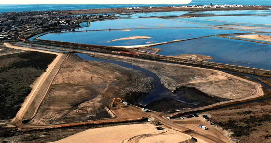
Otay River Estuary Restoration Project

Produces more than 50 million gallons of water every day