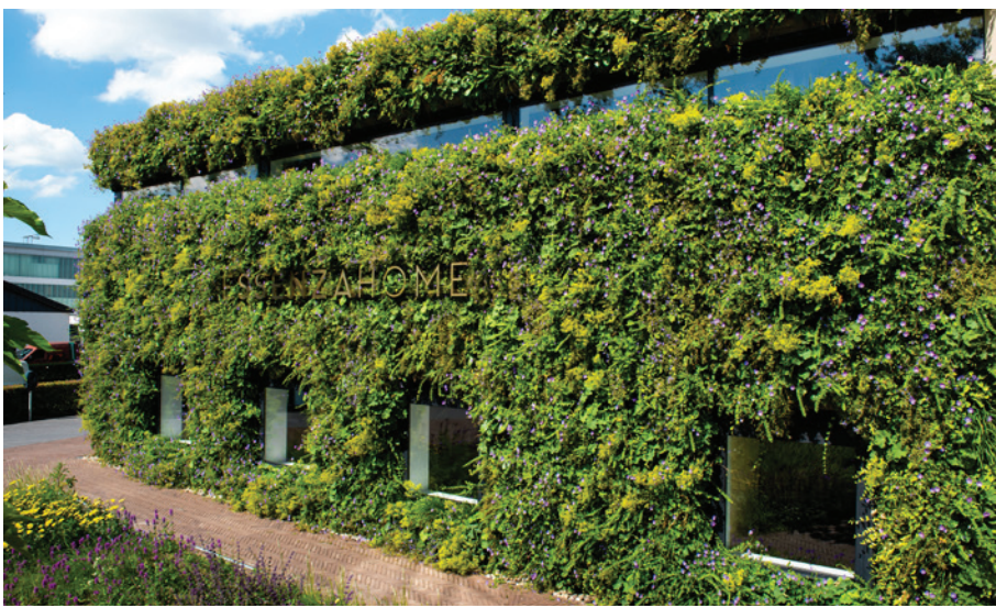
Vertical Garden Solutions—Embrace nature, enhance life.

Join Waste Not Consulting for our April workshop series and learn how to create or revitalize a recycling program in your workplace. Discover how you can make a positive impact through effective waste management strategies.