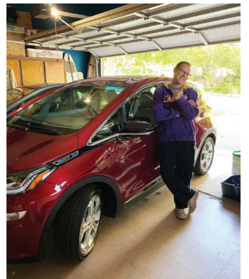
I personally joined the EV trend 3 years ago when I purchased a Chevy Bolt at Premier Chevrolet of Carlsbad. This car is so peppy and fun to drive.