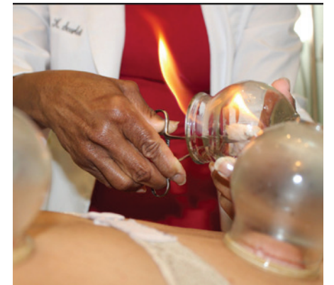
At Red Lotus Wellness Center, we educate patients on appropriate lifestyle modifications to support a robust immune system, reducing the need or dependence on over the counter and pharmaceutical medications.

• Safe Cleaning Products: We use non-toxic cleaning products in the clinic, helping to protect the health of both our practitioner, and patients.