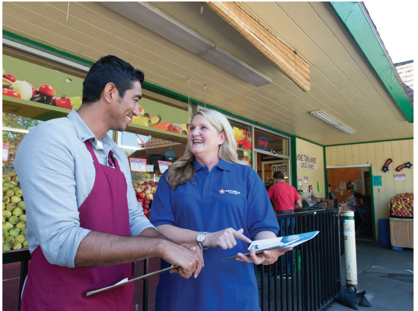
At Republic Services, we are committed to partnering with customers to create a more sustainable world.

Looking for hands-on experience in the environmental services industry? Republic Services will be attending each Carlsbad TGIF Summer Concerts in the Park to educate concert goers on 'what goes where' and how to properly sort waste using the three-bin system: trash, recycling, and organics.