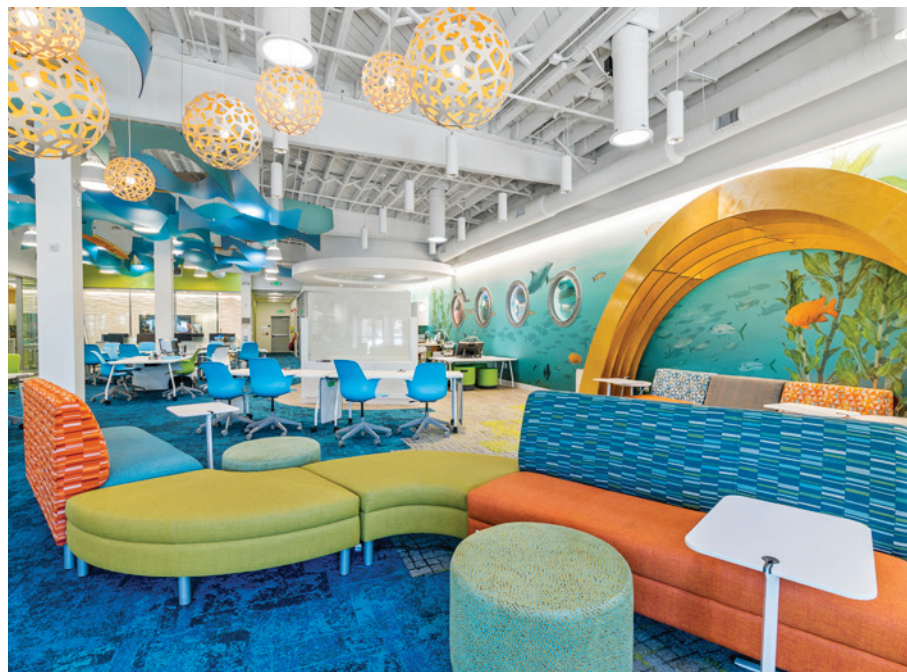
Altus Schools has 38 futuristic Resource Centers located throughout San Diego county

In preparing our students for a tech-driven