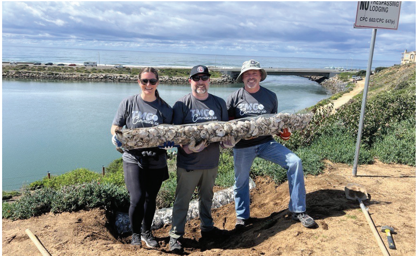
Preventing coastal erosion through upcycled oyster shells at Agua Hedionda Lagoon Foundation

When humans and nature collide, they become a crucible for innovative solutions. From regenerative to soilless, North County shares alternatives to outdated, traditional farming.