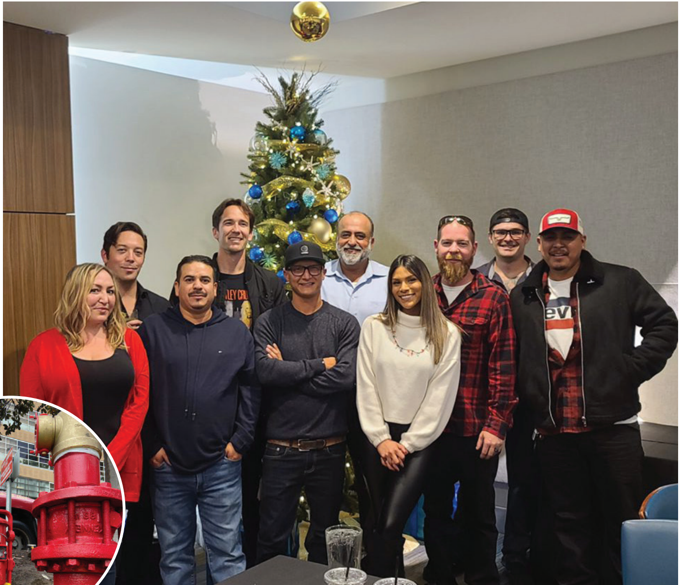
ASI Fire Protection provides a complete solution for businesses who are laser-focused on the continued growth and safety of their teams and property.