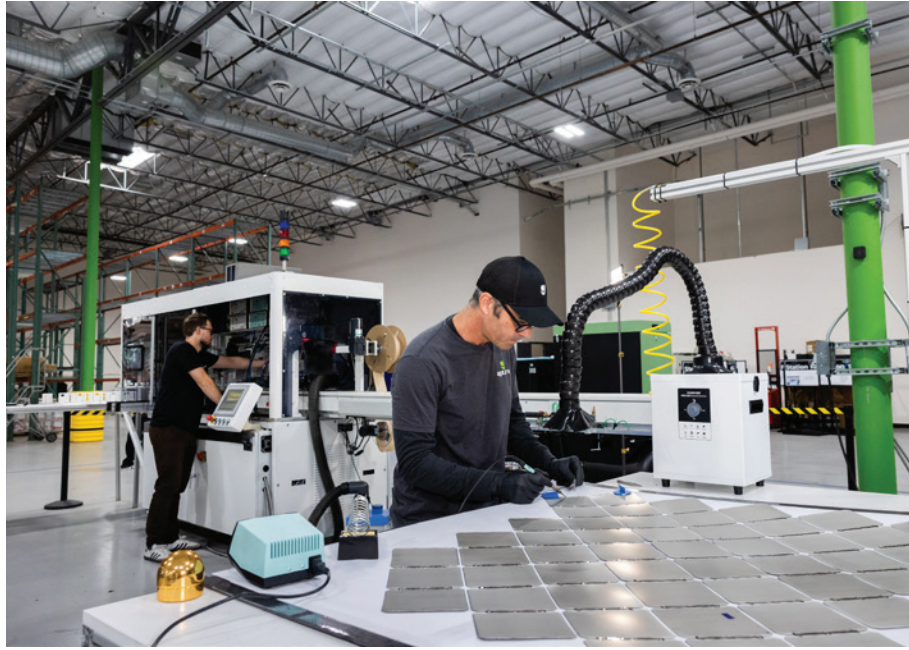
Aptera, a trailblazing solar-powered electric vehicle (EV) company based in Carlsbad, is redefining automotive efficiency and sustainability with their solar powered vehicle.

Carlsbad's cleantech landscape is a dynamic and innovative ecosystem, home to some of the most pioneering companies in the sector. At the heart of this vibrant community is Poseidon , the largest desalination plant in the Western Hemisphere,