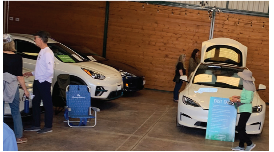
Join us on April 27th for the Annual Green Expo, featuring Carlsbad's most sustainable companies, test drive cars, and more!

The Expo is not just a display of products and services; it is an educational platform. Our seminars and workshops, curated with