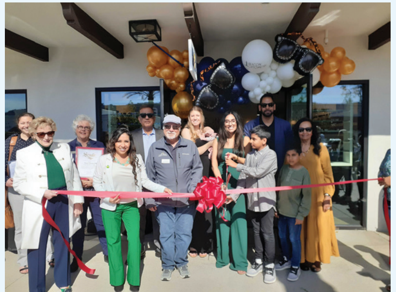
Congrats to Beacon Optometry on the Grand Opening. Carlsbad is thrilled to have you!