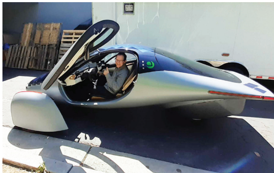
Carlsbad's own Aptera Motors offers an innovative 3-wheeled solar-powered electric car that will revolutionize sustainable vehicles.

I invite our community members, fellow business leaders, and residents alike to join us on April 27th. Let's come together to support and celebrate the strides we are making towards a sustainable future. The Carlsbad Chamber of Commerce's Green Business Expo is not just an event on the calendar; it is a pivotal moment in our journey towards a more environmentally conscious and vibrant community.