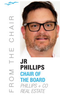
FROM THE CHAIR

As Chair of the Board of Directors of the Carlsbad Chamber of Commerce, I am thrilled to extend my warmest congratulations to Apex 365 Workforce Solutions , the recipient of the prestigious Business of the Year CBAD Award. In a community brimming with talent and innovation, Apex 365 has truly distinguished itself through its unwavering commitment