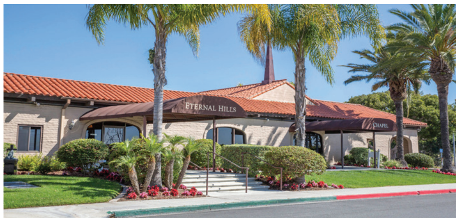
Eternal Hills, serving our community since 1948.

Join us Sunday, June 23rd and soak in the creativity at the coast, connect with fellow art enthusiasts, and enjoy the vibrancy of downtown Carlsbad.