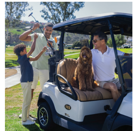
The Omni's newly upgrade Golf Course is dog-friendly.

these tournaments will return Carlsbad to the golf map (and the Golf Channel), the resort truly has something for everyone.