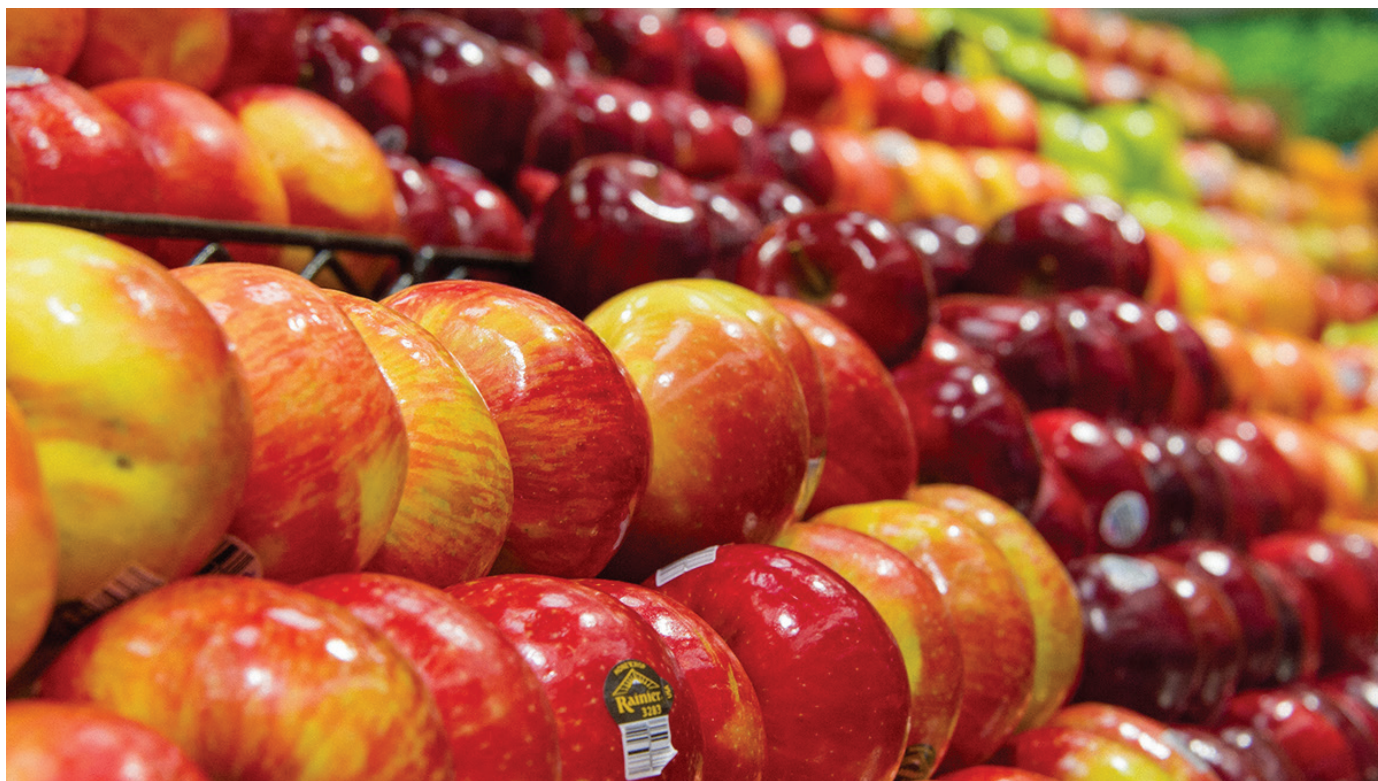
PLU codes, or price-lookup codes on your fruit and vegetables can be confusing. Scripps is here to break down what these various produce stickers reveal about your fresh picks.

The voluntary labels tell you whether you are purchasing organic or conventionally grown produce.