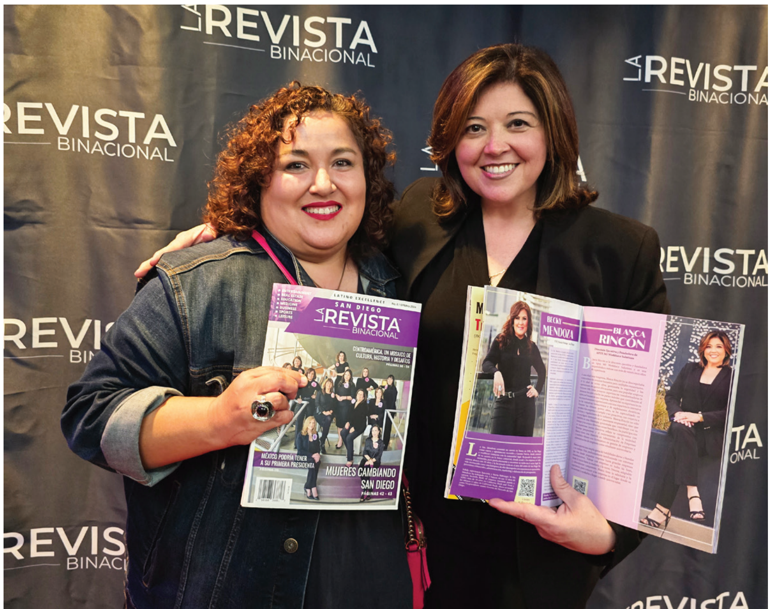
You can count on Apex 365 Workforce Solutions for proven expertise and a commitment to your success.