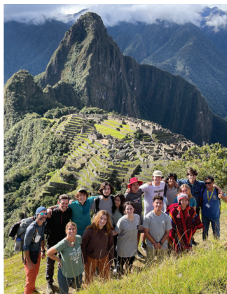
Pacific Ridge students travel with their teachers around the world for immersive Global Travel learning experiences at the end of each school year.

Students in grades nine through 12 continue their explorations in an environment that allows them to pursue their interests in-depth. A robust curriculum with honors and AP courses is matched with opportunities in student-led service groups, clubs, activities, athletics, the arts, and global travel. When it comes time to apply to college, Pacific Ridge students understand what they want from their college experience, and the skills they've learned allow them to flourish, in college and beyond. For more information about Pacific Ridge School, please visit www.pacificridge.org .