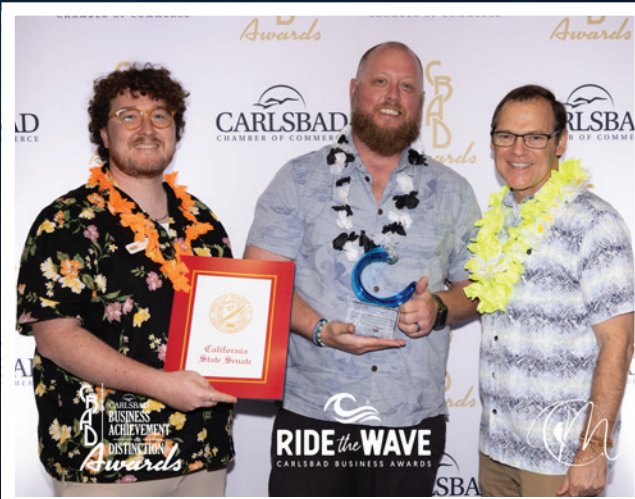
Nonprofit of the Year: +BOX