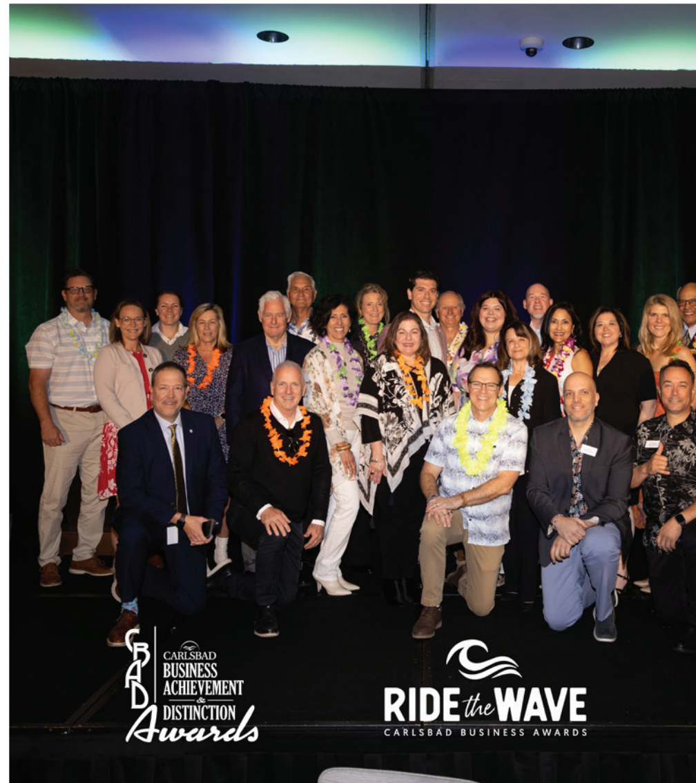
2024 Board of Directors