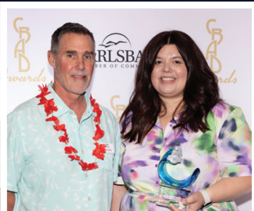
New Business of the Year: Parker & Hart