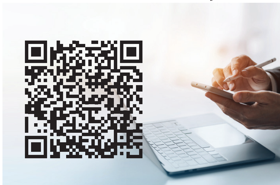
If you'd like to see how you fare across the 10 key areas of financial planning, scan the QR code.

A strategy can then be built on a simple understanding of the concepts of spending less than you earn, investing and insuring for your unknown future, providing for short term expenses, compound interest, and