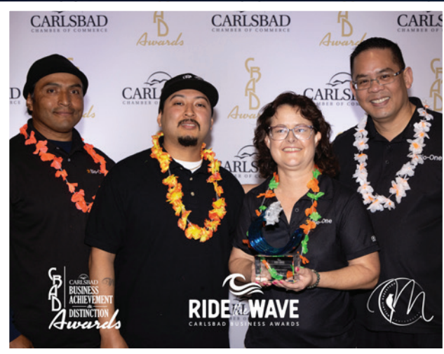
Community Impact of the Year: Bio-One