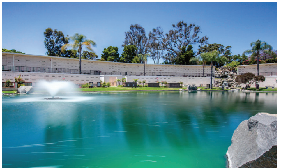
Inside our Memorial Park at Lakeview Gardens, Estates, and Mausoleums.

From the moment we are contacted, our team of dedicated professionals is here to support families in every step of the way. We understand that planning a funeral can be