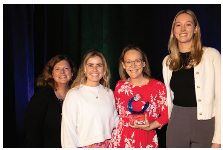
Best Place to Work, Small Business: Visit Carlsbad