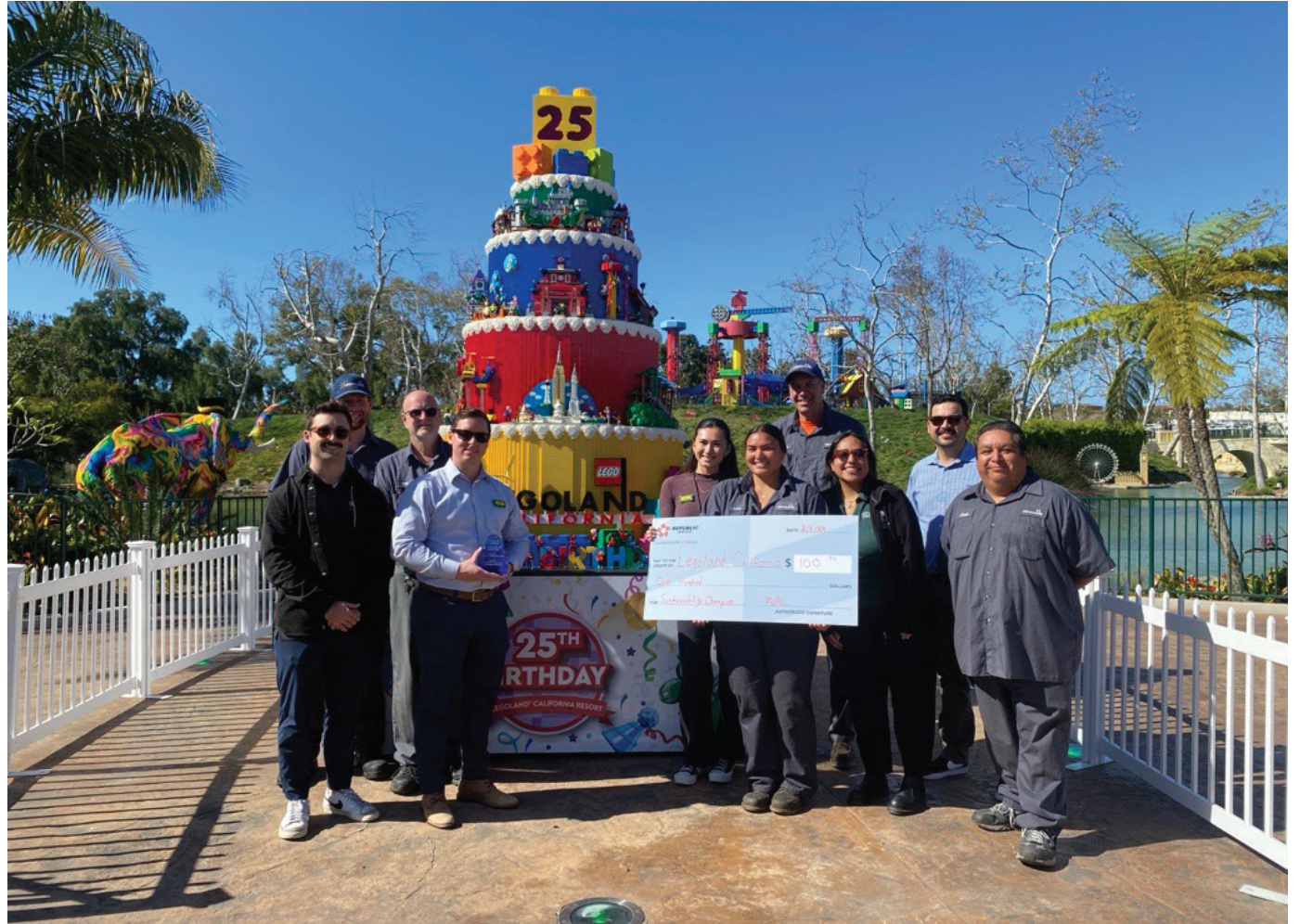
LEGOLAND California is Republic Services and The City of Carlsbad's recipient of the Sustainability Champion Award for Spring 2024.

What sets LEGOLAND apart is its transformation of conservation endeavors and recycling protocols into a self-sustaining ecosystem. The park has a Materials Resource Facility on site where waste is sorted and handled, contributing to their goal of achieving Zero Waste. Internal programs, including the Reuse Program and LED retrofit projects,