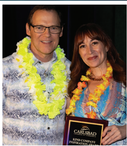
Kind Company of the Year: Shear Karma