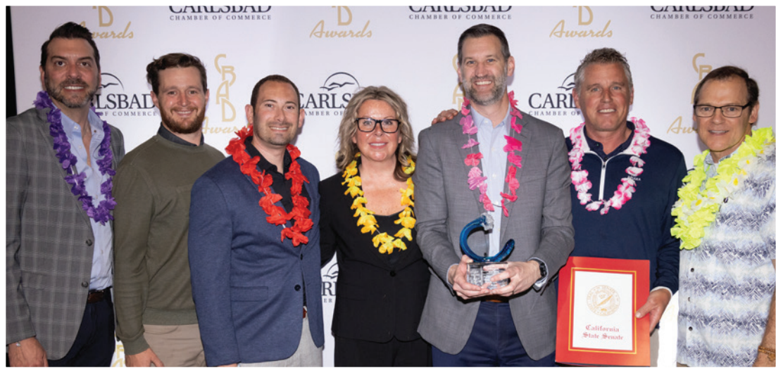
People's Choice: Park Hyatt Aviara