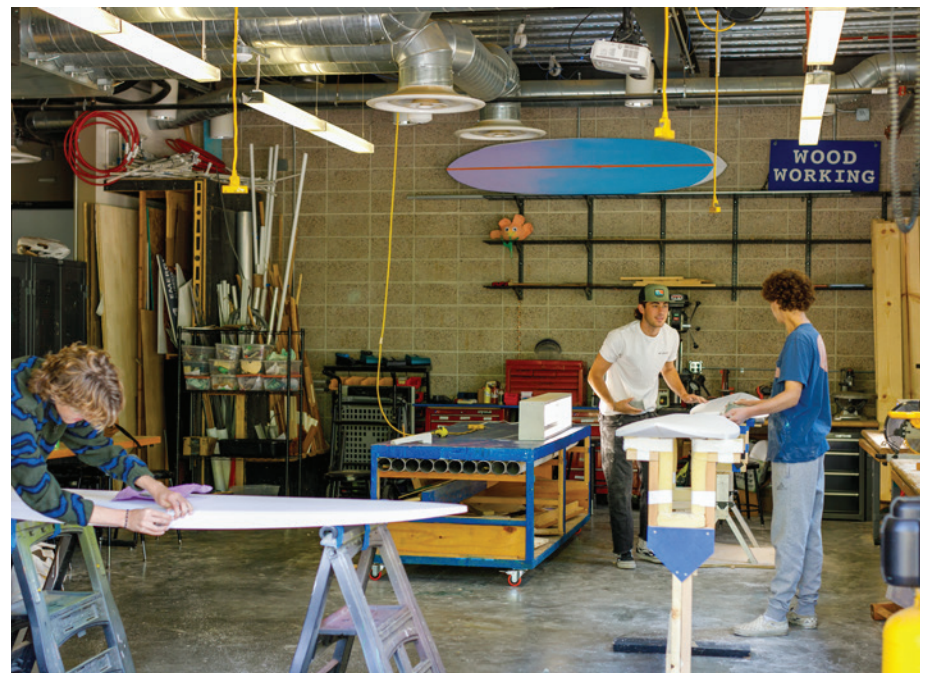
Innovative curriculum that allows for academic challenge and exploration, includes elective courses like Surf and Sk8 where students learn to design and fabricate custom surfboards.

Teachers take an active role in student well-being, working together to understand each student's needs. They offer support, kindness, and understanding,