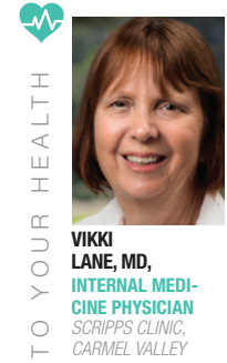
TO YOUR HEALTH

When you reach for a piece of fruit or vegetable at the grocery store, you may notice a small sticker on the skin with numbers. These vegetable and fruit sticker numbers often have important information.