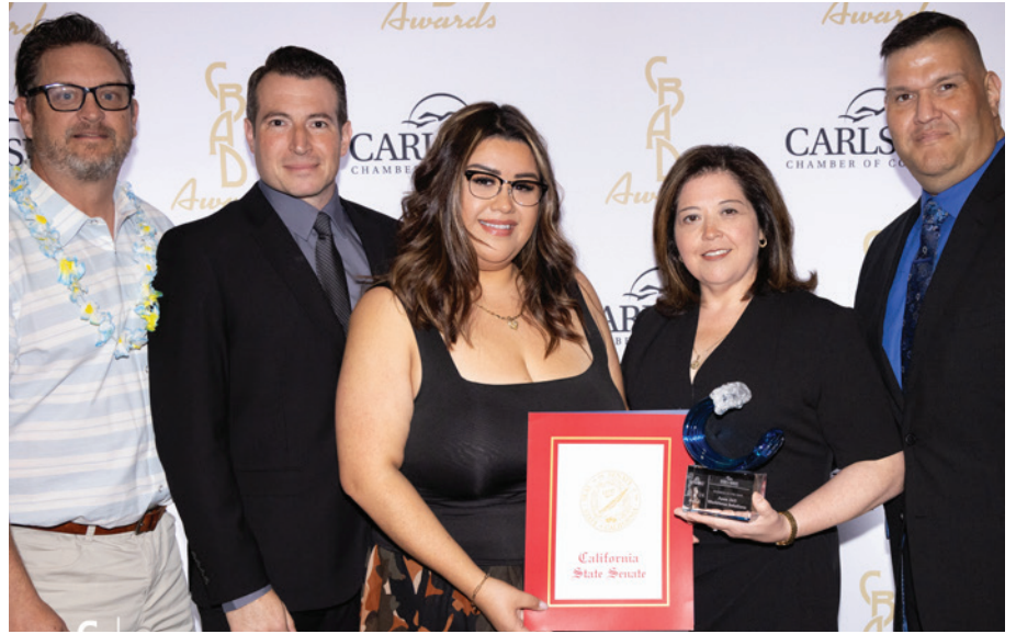
Congrats to Apex 365 Workforce Solutions on winning the 2024 Business of the Year!

This dedication to continuous improvement and innovation is what I believe sets Apex 365 apart and has propelled them to the forefront of their industry. Their willingness to challenge the norm and embrace change has not only driven their own success but has