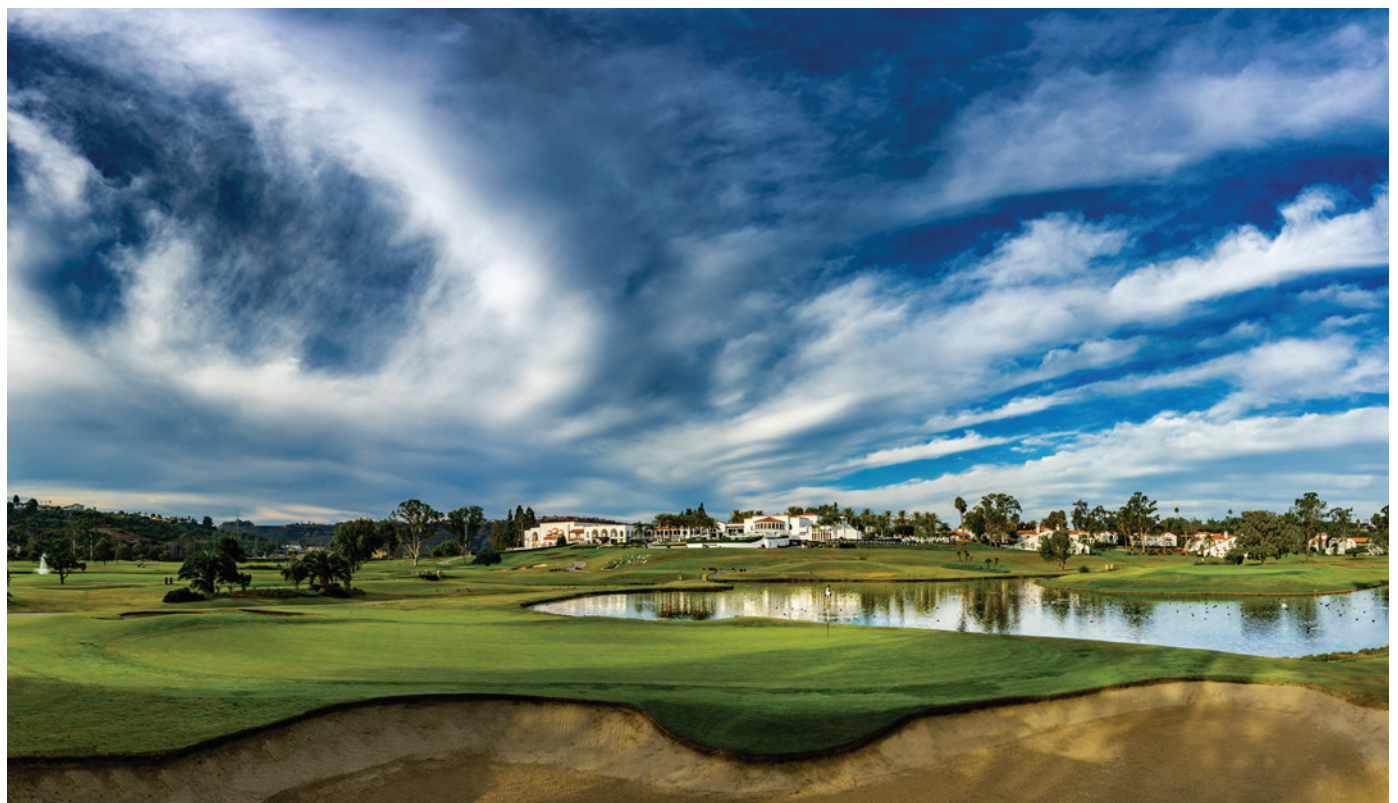
The Omni La Costa Resort Golf Course has a new look! Check out the recent Champions Course multi-million-dollar renovation.

On behalf of the Carlsbad Chamber of Commerce and the entire community, I extend my heartfelt congratulations to Apex 365 Workforce Solutions on this well-deserved honor. May your continued success inspire others to reach for the stars and may you continue to be a beacon of excellence in Carlsbad and beyond.