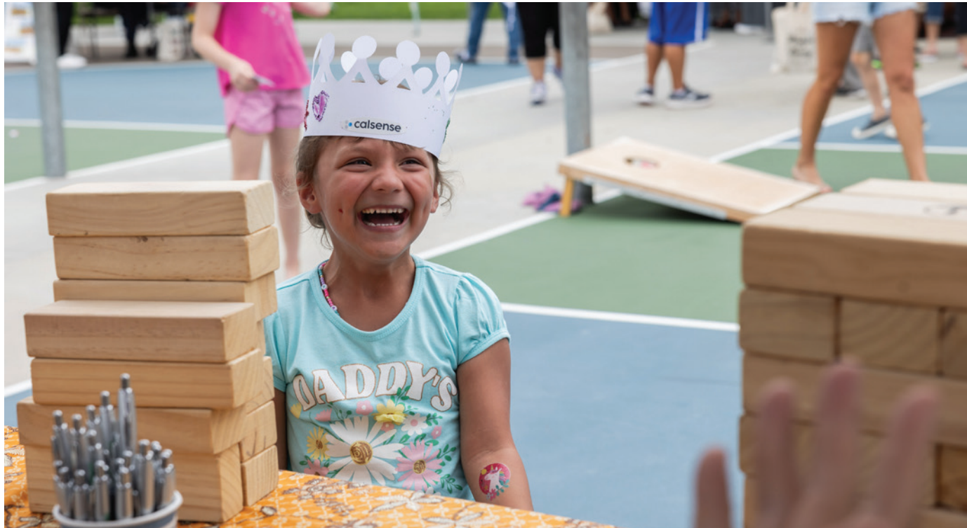
Carlsbad is not only a vibrant destination for tourists, it is an active and fun community for its residents seeking relaxation and adventure.

Creating unique, tailored experiences can make a significant difference. For instance, our hotels often offer special weekend packages that include spa services, dining credits, or guided tours to local attractions. Retail businesses can capitalize on this trend by creating exclusive discounts or custom services like personal shopping experiences that cater to both locals and tourists.