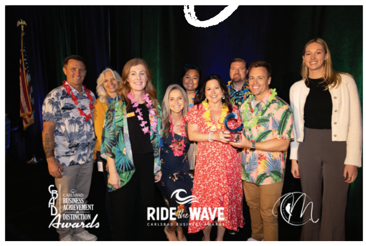
Best Place to Work, Large Business: LEGOLAND