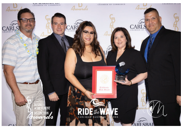
Business of the Year: Apex 365 Workforce Solutions