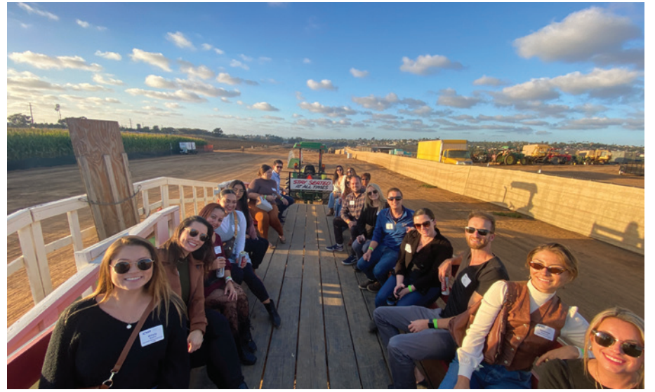
CYP at our annual event at the Carlsbad Strawberry Company Pumpkin Patch.

We also partner with our neighbor in Oceanside once they created a YP group in 2019. We regularly do events together either in Carlsbad or Oceanside. If you are a young professional or know one, please let them know about this unique group. We would love to have those jump in with us ASAP.