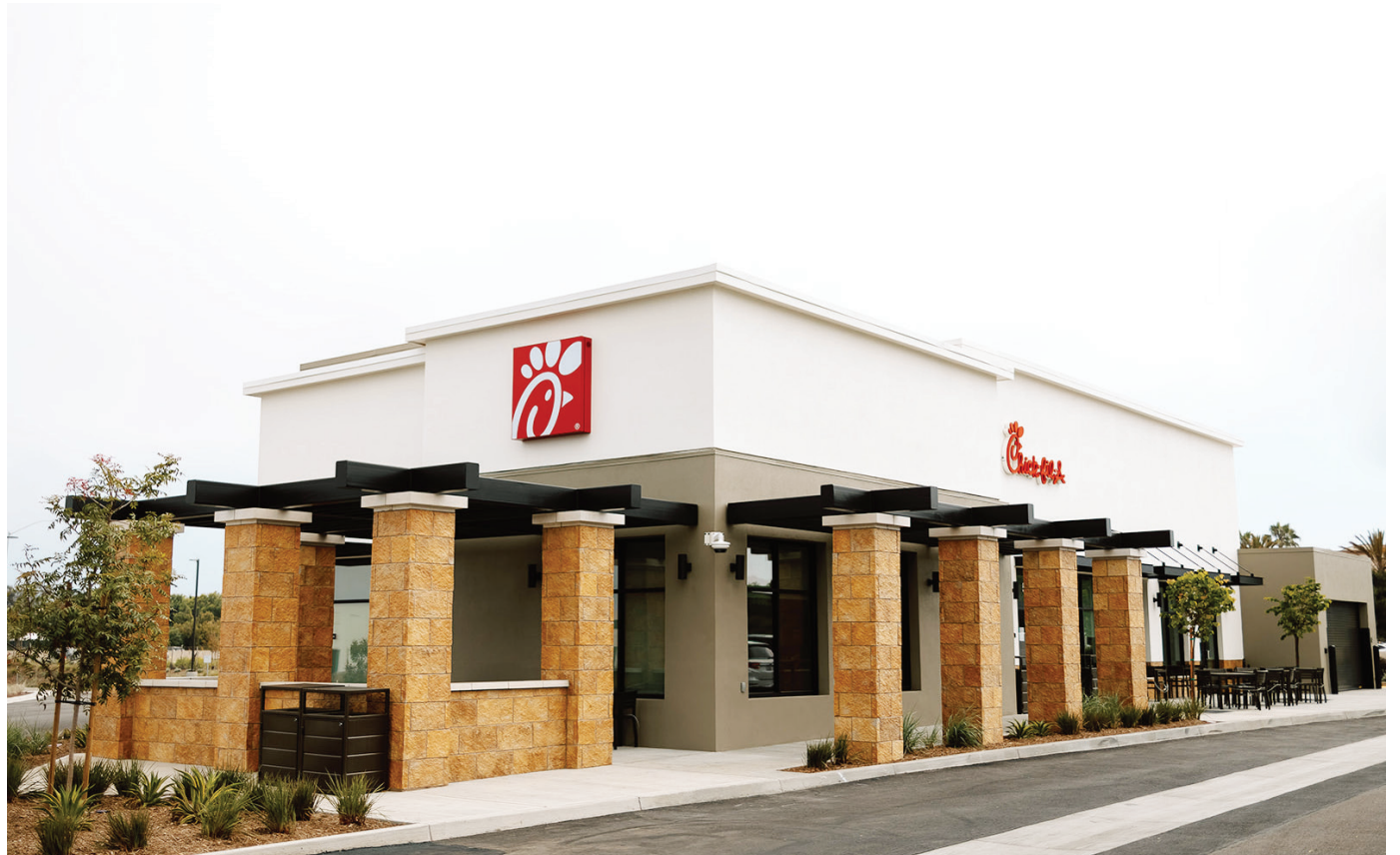
Located at 5848 Avenida Encinas, Chick-fil-A Carlsbad West will be open for dine-in, carry-out, catering pickup and delivery from 6:30 a.m. to 10 p.m., Monday through Saturday.

In celebration of the opening, Chick-fil-A,