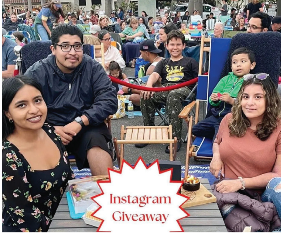
Flicks at the Fountain runs for five consecutive Thursday nights starting July 11th through August 8th.

So, as the sun sets and the stars come out, join us for another summer of magic at Flicks at the Fountain for five consecutive Thursday nights starting July 11th through August 8th. Grab your blankets, pack some snacks, bring a low back chair, and get ready