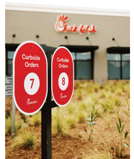
Curbside orders are available for added convenience.

Chick-fil-A, Inc. is the third largest quick-service restaurant company in the United States, known for its freshly-prepared food, signature hospitality and unique franchise model. More than 200,000 Team Members are employed by independent owner-operators in more than 3,000 restaurants across the United States, Canada, and Puerto Rico. In 2023, the company shared plans to