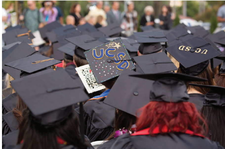
MiraCosta College offers transfer students support, including transfer counselors, presentations on transfer options, and application support.