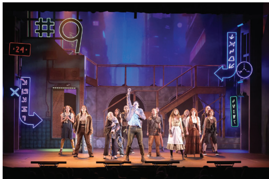
LCC students performing in their state-of-the-art theatre for this year's spring musical.

For more information on SDUHSD, please visit www.sduhsd.net