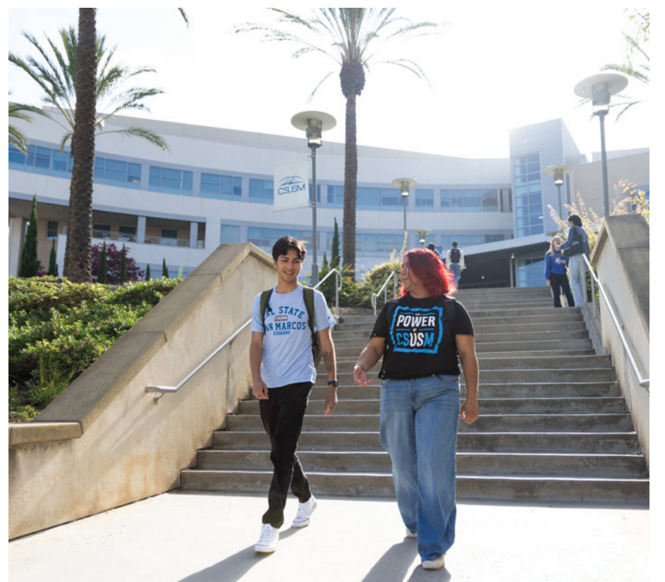
The Executive in Residence program offers invaluable mentorship to the growth of aspiring business majors.