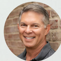
Keith Blackburn MAYOR City of Carlsbad