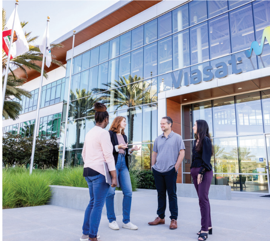
Leading employers like Viasat make Carlsbad stand out as the nexus of significant opportunities in the growing space technologies sector.

The region's roots in the defense industry have laid a solid foundation for its current and future technological advancements. Carlsbad and the greater San Diego area have a storied history of transferring defense technologies to the commercial sector. Companies like Linkabit and Qualcomm pioneered CDMA technology, revolutionizing mobile communications and setting the stage for the modern wireless world. Viasat continues this tradition with its innovative satellite communications, underscoring Carlsbad's role as a hub for technological