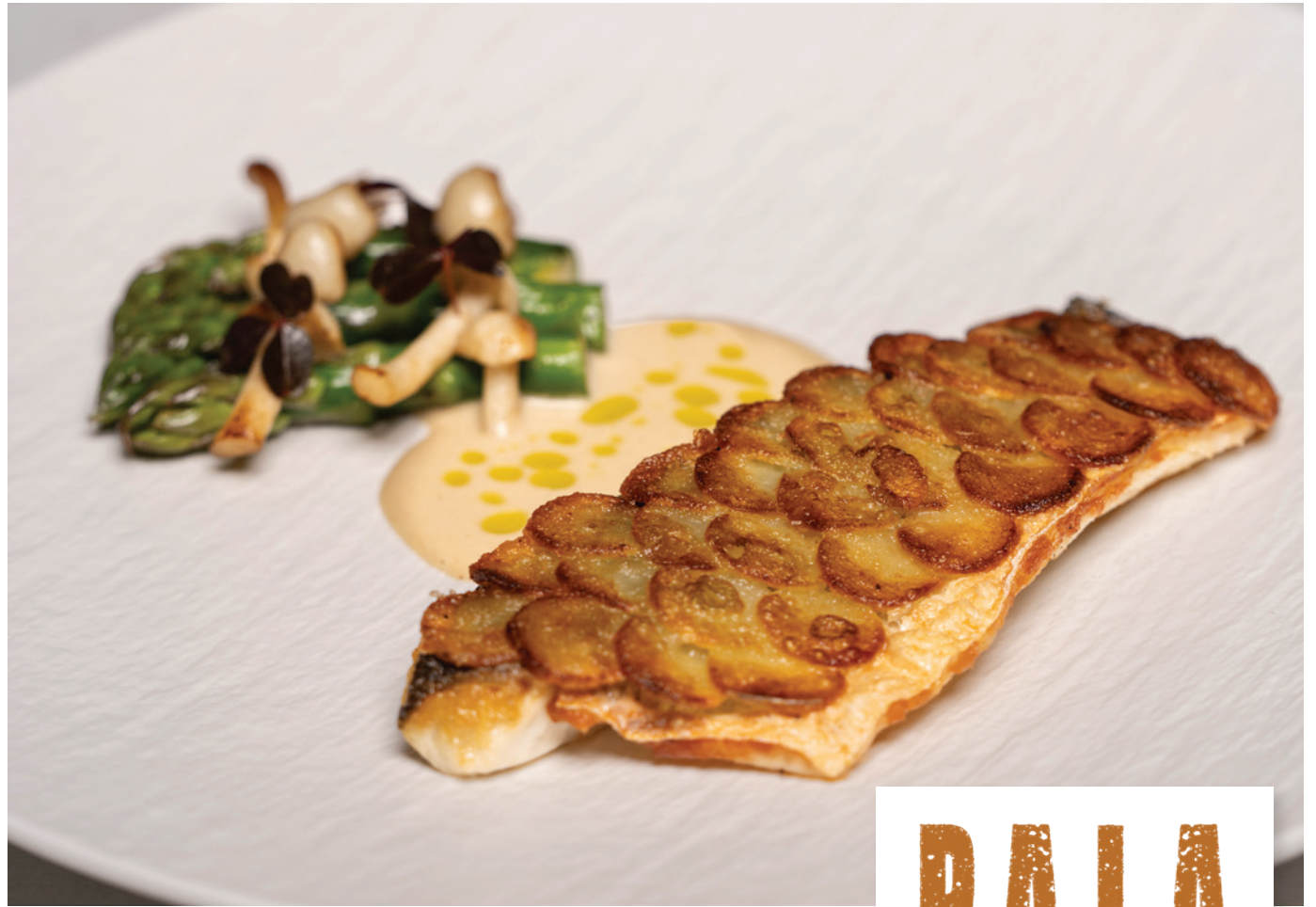
Pala Casino's newest restaurant, Elementa, represents more than just a restaurant, it is art in its truest form. Each dish is its canvas.

Parlette's work highlights his deep connection to nature and his adventurous spirit, elements that are palpably reflected in the environment of Elementa. His artistic process involves choosing materials that echo the natural patterns, colors, and textures of his subjects, enhancing the authenticity and