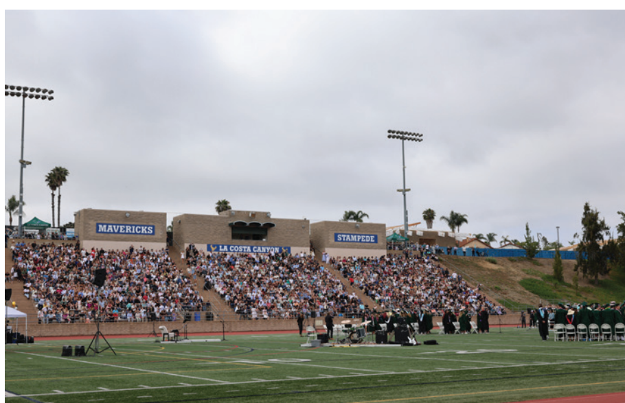
LCC's graduating class of 2024 enjoyed their commencement ceremony on Friday, May 31.