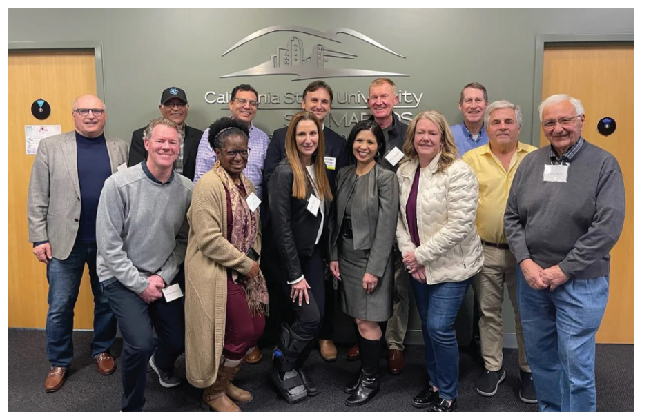
California State University of San Marcos's College of Business Administration (CoBA) works closely with our business, nonprofit, and community partners.

If you like to pay forward what you have experienced and received, consider becoming an Executive in Residence with CSUSM. It is a very rewarding experience to meet and mentor the upcoming work-