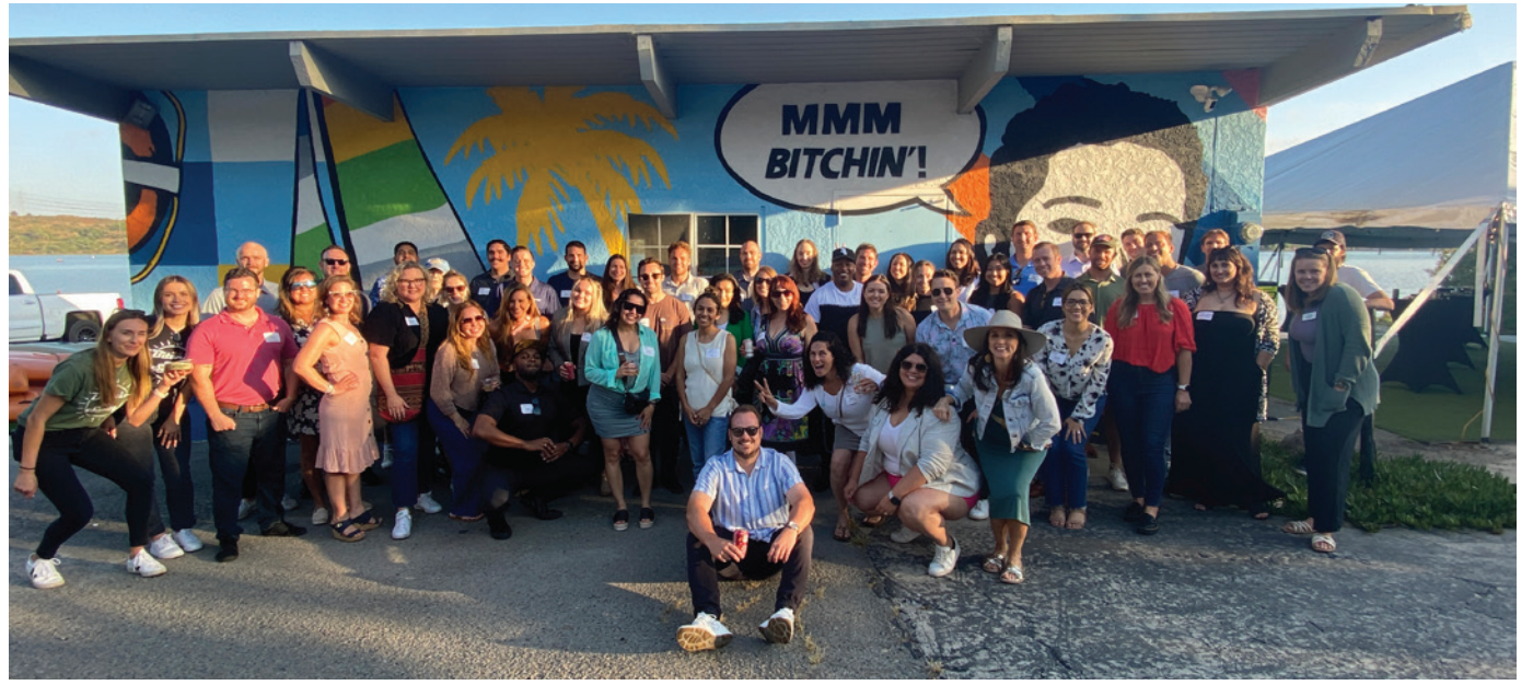
CYP at Bitchin' Sauce's Bitchin' Beach Club. Whether you're a local young professional or know someone who is, we'd love to chat with you about joining CYP!

The goal of Carlsbad Young Professionals is an organization founded to meet the social and networking needs of ambitious, young professionals in the North County region. The meetups vary between casual mixers or meetings with an educational component. CYP provides opportunities to meet new people, engage in leadership opportunities, and develop relationships that can help further careers and/or businesses. We created a CYP Steering Committee