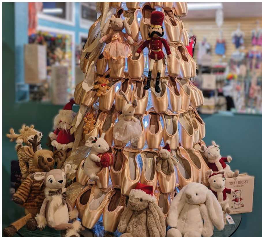
Small Business Saturday is Nov. 30 and our 12 Days of Dancemas begins Dec. 6.

540 Carlsbad Village Dr. Carlsbad CA 92008 760-913-9139 www.dancinsoul.com