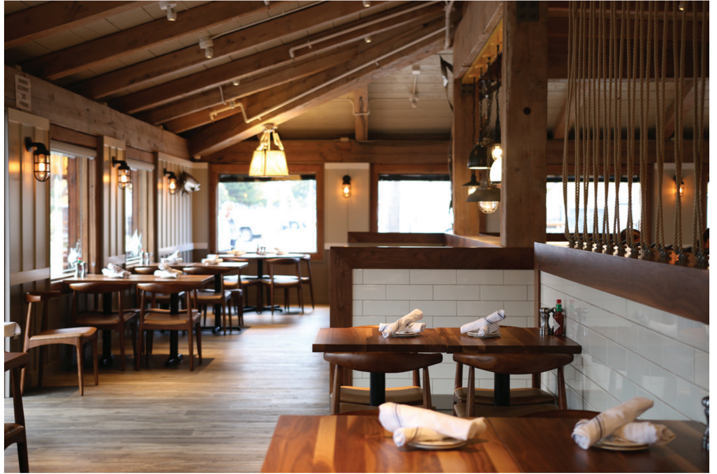
Chef Fernando Gomez is introducing lunch and dinner dishes that leverage Bluewater's access to up to 40 varieties of fresh sustainable seafood and shellfish.

Like all Bluewater neighborhood locations, Bluewater Grill Carlsbad is committed to not only serving the freshest seafood