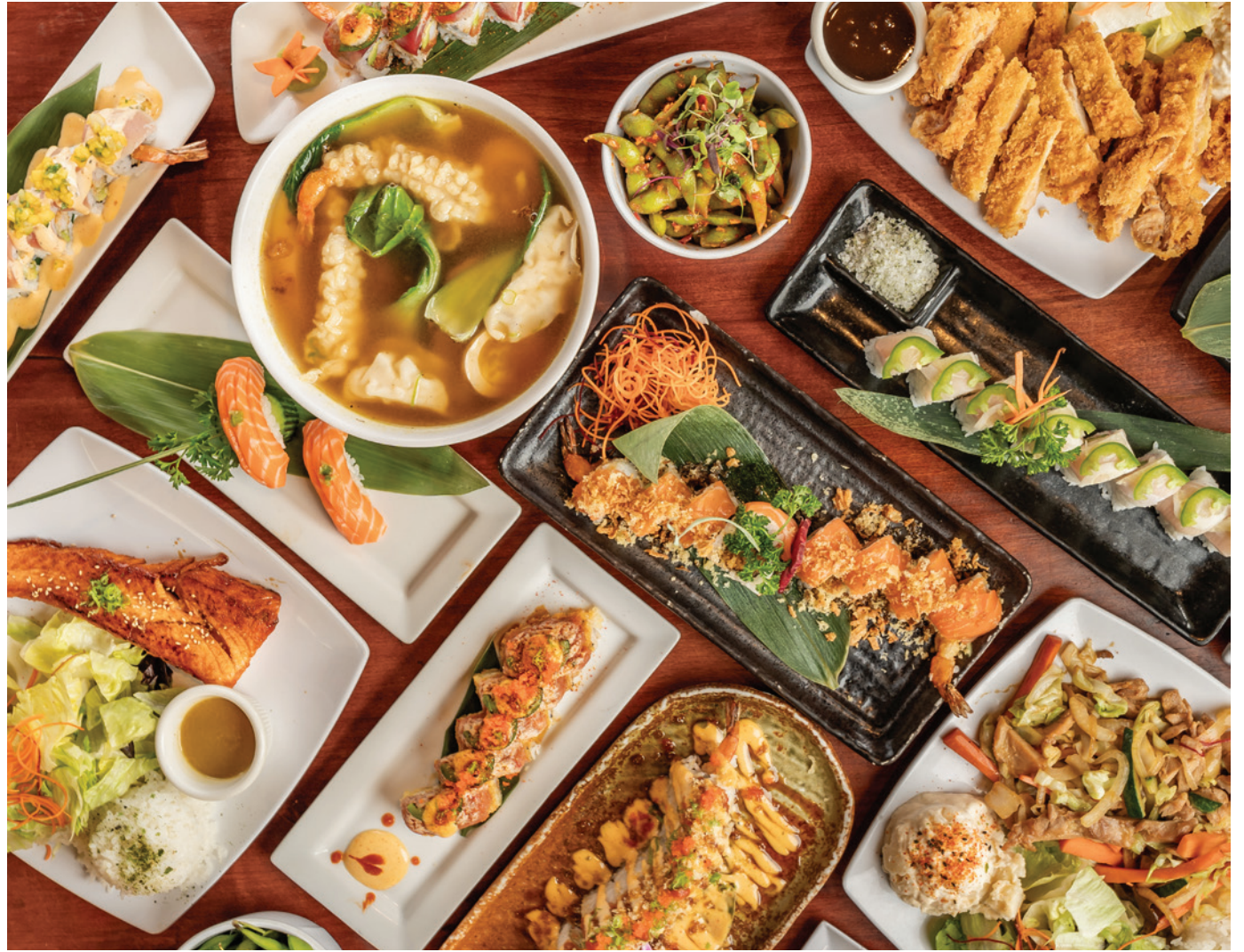
Be sure to try customer favorites like the Grandview Roll, Moonlight Roll, or our chef's whim omakase menus.

Their menu boasts an impressive variety of signature rolls, nigiri, and omakase options. Be sure to try customer favorites like the Grandview Roll, Moonlight Roll, or their chef's whim omakase menus, a masterpiece that embodies the restaurant's quality ingredients and chef's creative flair. For those looking to sample beyond sushi, Kai Ola also offers delectable poke bowls, ramen noodles, and savory appetizers like crispy shishito tempura and hamachi kama.