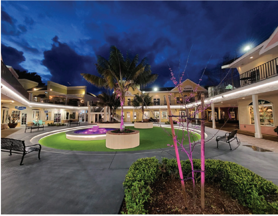
Restaurants and shops surround a family friendly fountain courtyard that lights up in the evening.