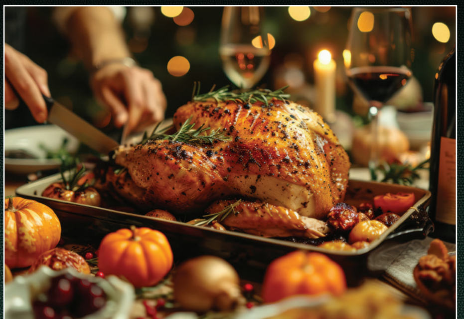
Experience the art of dining at Pala Casino.

Hours: Thursday-Saturday- 5pm-11pm Private Dining Capacity: Buyout Only Seating Capacity: 24