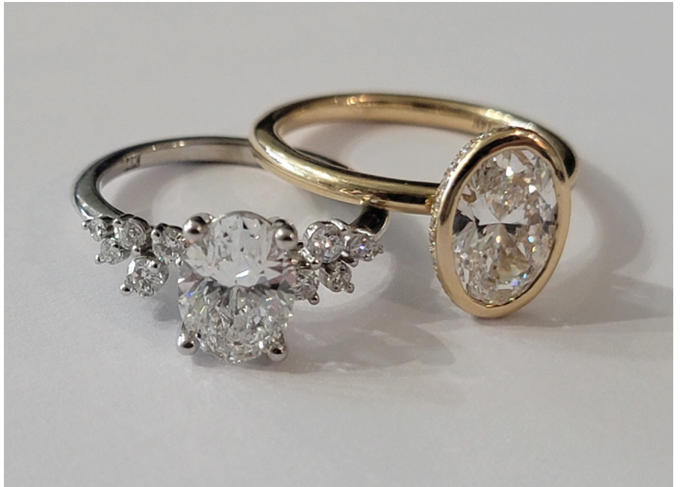
Gems of La Costa offers personalized services to help you design a custom piece that reflects your unique personality and style.

At Gems of La Costa, they believe that every piece of jewelry should be as special as the person who wears it. That's why they offer personalized services that go beyond simply selling jewelry. Their professional team can help you design a custom piece that reflects your unique personality and style.