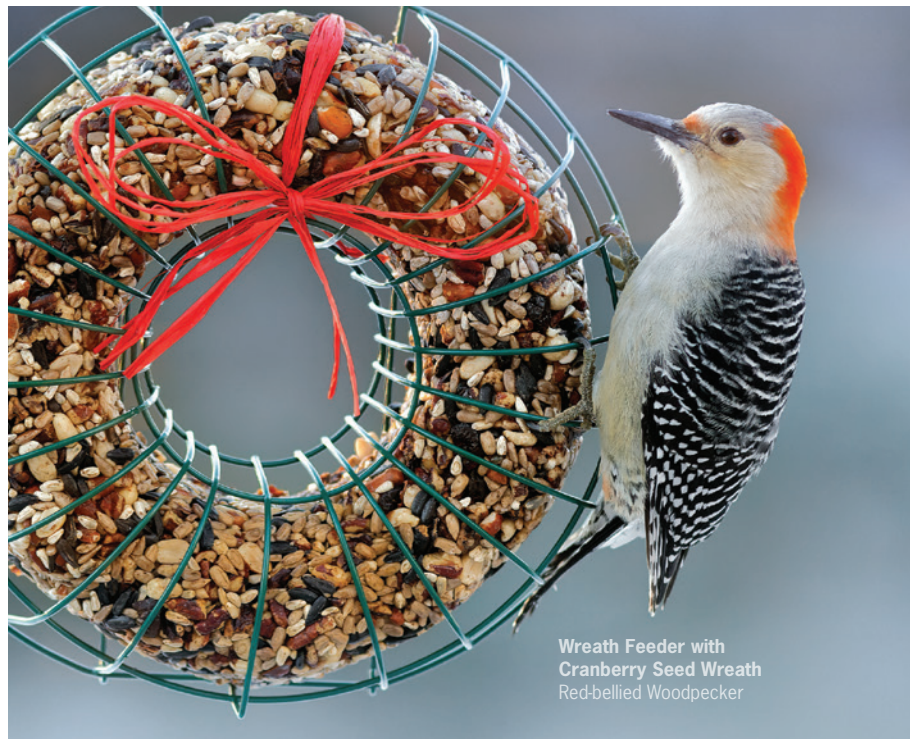
Wreath Feeder with Cranberry Seed Wreath Red-bellied Woodpecker

Open: Monday-Saturday 10 am - 5 pm. Sunday 10 am - 4 pm