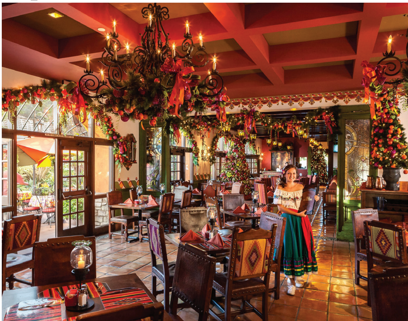
The festive spirit of Mexico embraces all guests who walk through the doors of Diane Powers' Casa de Bandini

Casa de Bandini hosts one of the best happy hours in North County! Its lively Cantina is home to more than 95 varieties of premium and specialty tequilas, over 15 specialty house margaritas, and of course its famous "Bird Bath" margaritas! Visit the Cantina every Monday through Friday from 3 to 5 p.m. for specials on selected drinks and shareable plates such as the "Muchos" Taquitos and the Soft Street Tacos. Add even more festive flair with a serenaded evening by Casa de Bandini's world-class Latin American folk band,