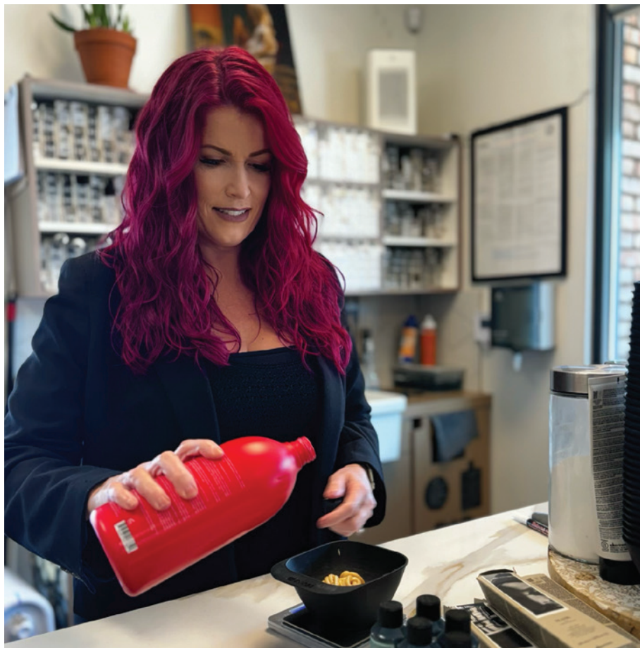
Achieve confidence and self love through beauty at Twig Hair Lounge.