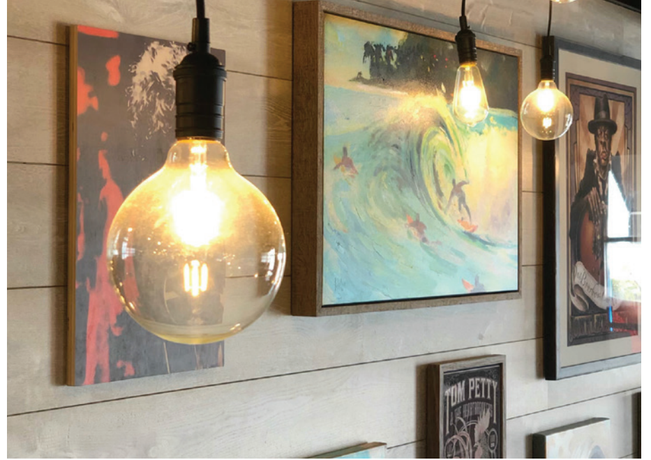
Le Papagayo, nestled in the heart of Carlsbad, California, is your ideal destination for unforgettable holiday parties.

isfied. From hearty appetizers to exquisite entrees, there's something for everyone at Le Papagayo. To enhance your experience, we feature live music every night, creating a lively and inviting atmosphere that sets the tone for your holiday festivities. Picture your gathering filled with laughter, joy, and the sounds of talented musicians, making your event memorable for all who attend. Booking your holiday party at Le Papagayo not only guarantees a delightful dining experience but also allows you to relax and enjoy the celebration without the hassle of planning. Our team is committed to making your event seamless, ensuring that you can focus on what matters most—spending time with your loved ones. Don't miss out on the opportunity to host your holiday celebration at Le Papagayo! Call us today to reserve your date and start planning an unforgettable event that your guests will talk about for years to come. We look forward to celebrating with you!