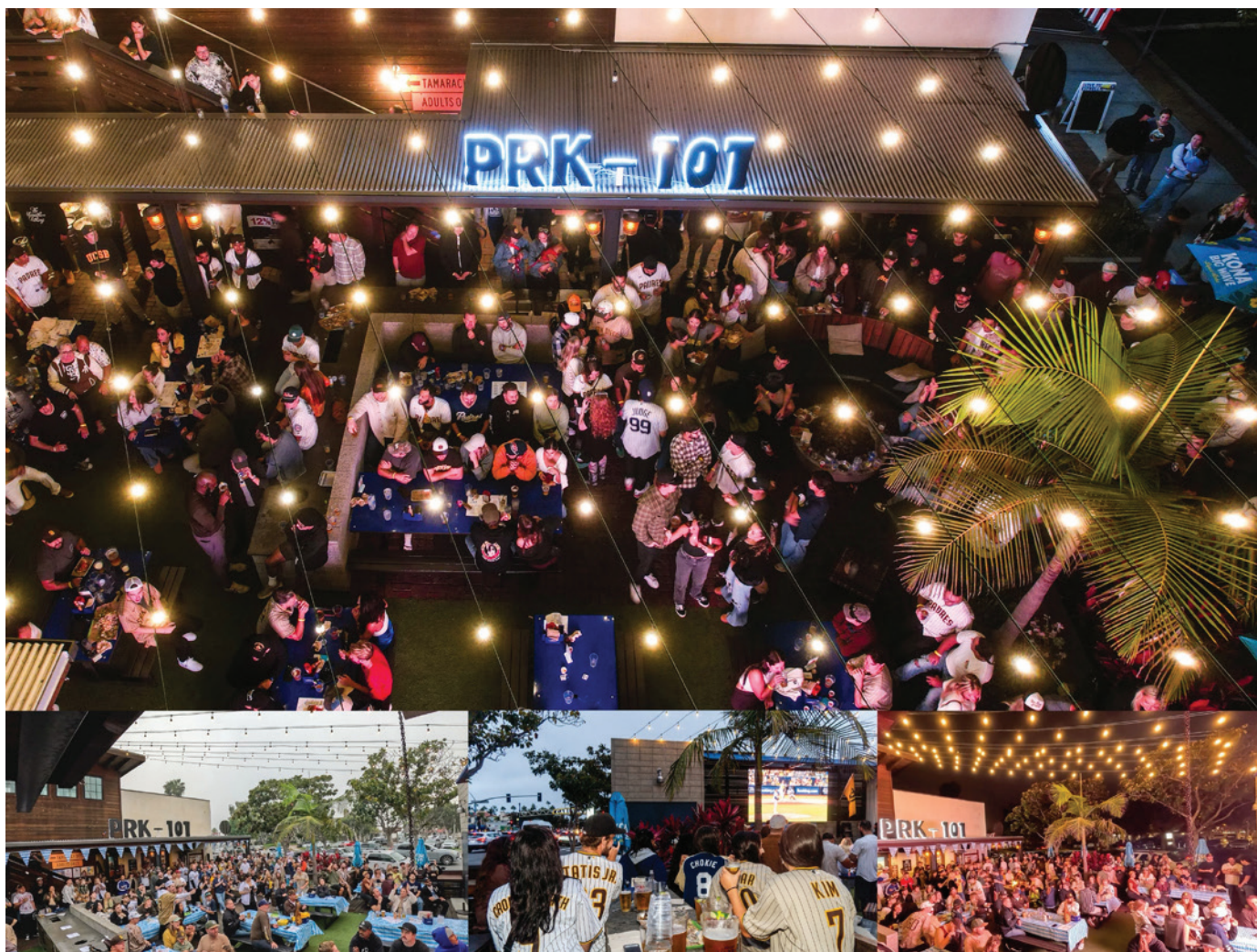
Join us at PRK101 for a fun-filled experience where great BBQ and sports come together in a vibrant setting.

Sports fans will revel in our state-of-the-art jumbo LED screen, perfect for catching all the big games while enjoying your favorite BBQ dishes. Whether it's game day or just another night out, PRK101 is the ultimate spot to cheer on your team with friends. Our enthusiastic staff is always